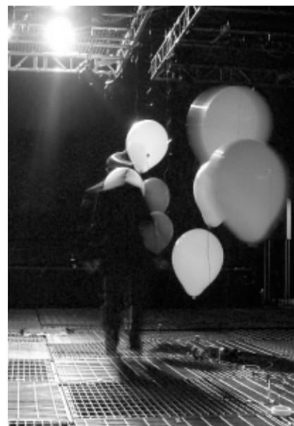
Figure 4. Cross-Pollination set up in SARC’s Sonic Lab.

In Cross-Pollination there is an explicit sharing of physical space, a sharing of interaction, between agents and between interactants in a shared context. Interactions within and with this installation could however, also be conceptualised on a social level, either as human to human interactions or as human to agent interaction. This social interaction is highlighted by the dislocation of acoustic energy, interactions at one point in the space have repercussions elsewhere, effecting other users experience of the piece. The agents are connected in an ecology with each other and the space, they communicate with each other through sound and through electricity, actants in the space do the same thing, especially in the moment of performance. The human participants become part of the installation, acting almost as other agents in the piece, entering into the ‘natural’ environment, into the shared ecology, acting as catalysts for change and intervention. There is a sharing of acoustic energy, a sociality of music making. Through a communication of musical ideas in performance, music is created in the social interactions within the installation environment, be they between humans and humans or humans and machines. This sociality is fostered by interacting in the real, through the shared environment, through the physicality of the agents and their embodied presence in a shared context.