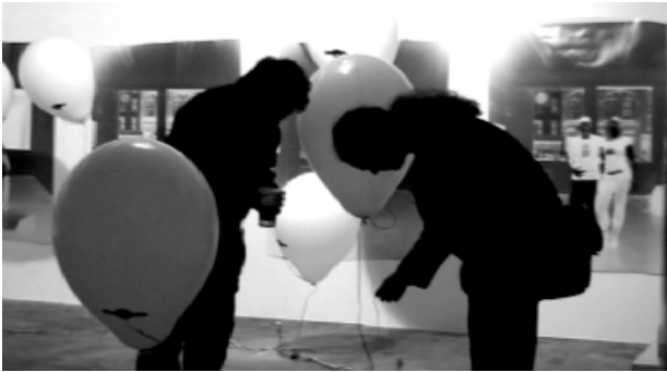
Figure 1. Cross-Pollination as exhibited at FIX'07 biennial performance art festival, Catalyst Arts, Belfast.