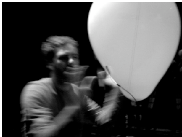
Figure 3. Cross-Pollination set up in SARC’s Sonic Lab.

Bishop [2] introduces us to a number of artists who see the meaning of their work arising from an interaction between the work and the viewer itself. Bishop describes such work as ‘incomplete without our direct participation.’ She cites in particular Litchwand , (2000), a work by Carsten Höller which is literally a wall of lights that constantly turn on and off. Bishop points out this installation is designed to have a physiological effect on the viewer it is meant to dislocate and disorient but for this it requires the viewer to be present and perceiving. This relationship between the viewer and art is based on Höller’s understanding of perception as ‘something mutable and slippery’. Höller, doesn’t see perception as a function of a detached Cartesian mind but something that is ‘integral to the entire body and nervous system, a function that can be wrong-footed at a moments notice.’ [2]