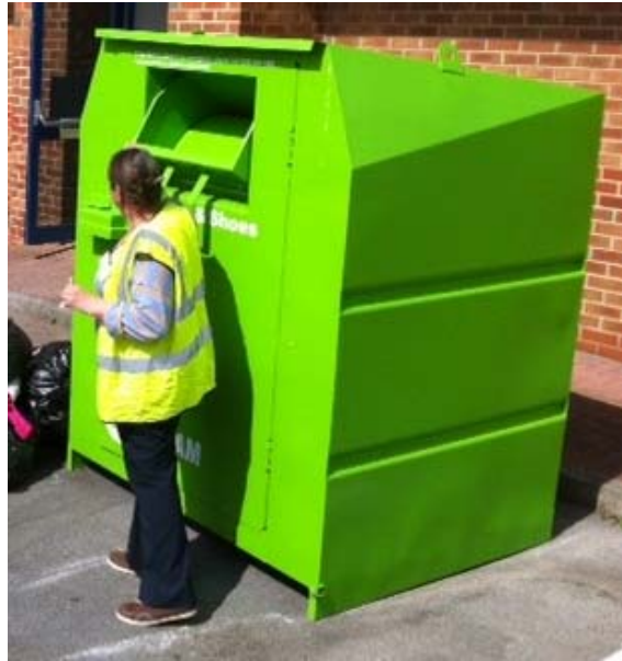
Figure 1 – Charity donation bank

A perceived problem with the fixed collection rounds often used in charity logistics, and a problem experienced in this case study, is that some banks may contain relatively few items when visited, while other banks may have been full for several days before a collection was made. In this case a more dynamic and flexible collection scheduling approach may be appropriate particularly where containers fill at highly variable and unpredictable rates, or, where unnecessarily long trips to only partially filled banks are being made (Johansson, 2006). This more dynamic and flexible approach can be enabled through remote monitoring of banks and other assets, Remote monitoring may also help in identifying incidences of theft from banks and could, in principle, affect the collection policy (e.g. visit more frequently), although this aspect has not been considered here.