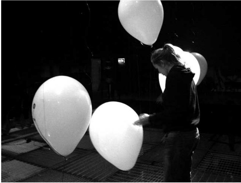
Figure 3. A participant interacting with the Cross-Pollination installation.

installation has fallen into unobvious patterns of interaction seemingly caused by broken or disrupted electronics. However, when constituent parts were removed and tested they were found to be individually working. It was only in situ, as part of a bigger complex environment of interactions that they seemed to be malfunctioning. They were instead exhibiting emergent behaviours. Cross-Pollination is also open in a performative sense. As it is an interactive installation there is no prescribed way to interact with the work. Thus users can disrupt and alter these forming emergent structures through acoustic or physical interaction with the work, becoming active participants in an ecology of music-making (figure 3).