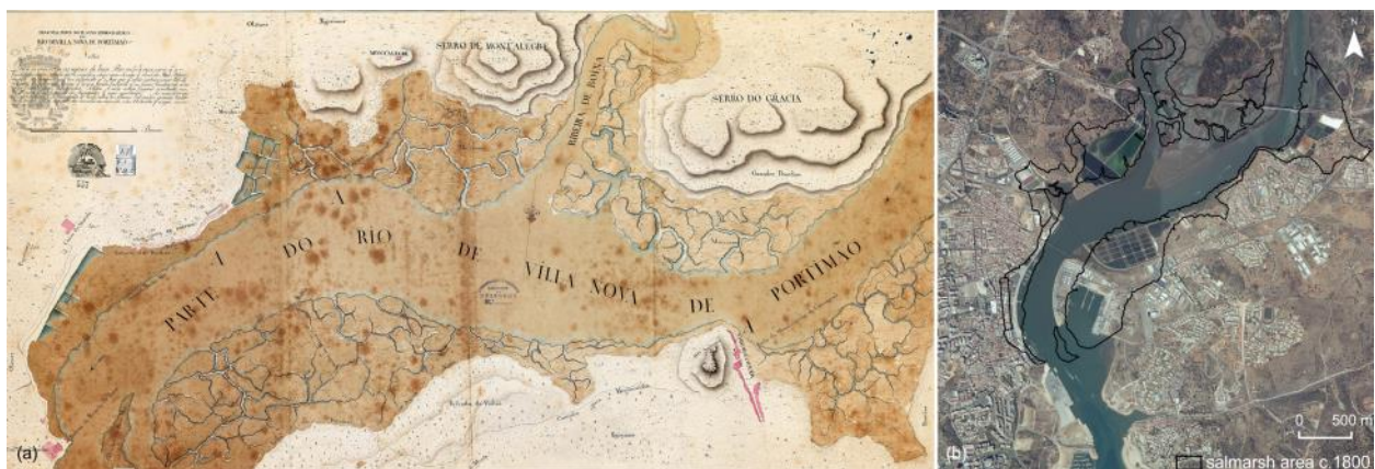
Figure 2. a) Arade River and surroundings in c. 1800 (Baltazar de Azevedo Coutinho, Geographic Military Institute-IGEOe), b) saltmarshes of Arade River in c. 1800 over ortophotomap of 2010

The analysis of land cover c. 1800 (Figure 2a) indicates that wetlands have been progressively urbanized in the area of Portimão (Figure 2b). Geoprocessing of historic maps revealed that saltmarshes occupied an area of 242 ha c. 1800. Analyses of aerial photography indicate that in 2010 the total area of saltmarshes was 118 ha. Therefore, 51% of saltmarshes in the Arade river mouth were lost between 1800 and 2010. Further analyses taking into account other areas along the Arade river indicate that in total 65% of the saltmarshes were lost between 1800 and 2010. Reclaimed areas along the river Arade correspond to excavated old marshes, filled with estuarine mud and protected from tidal influence, with the purpose to create land for agriculture. Estuarine muds, nutrient-rich, were used to fill the reclaimed saltmarsh and build dykes structures upstream the Boina and along the left shore of the Arade river (Vieira, 1911).