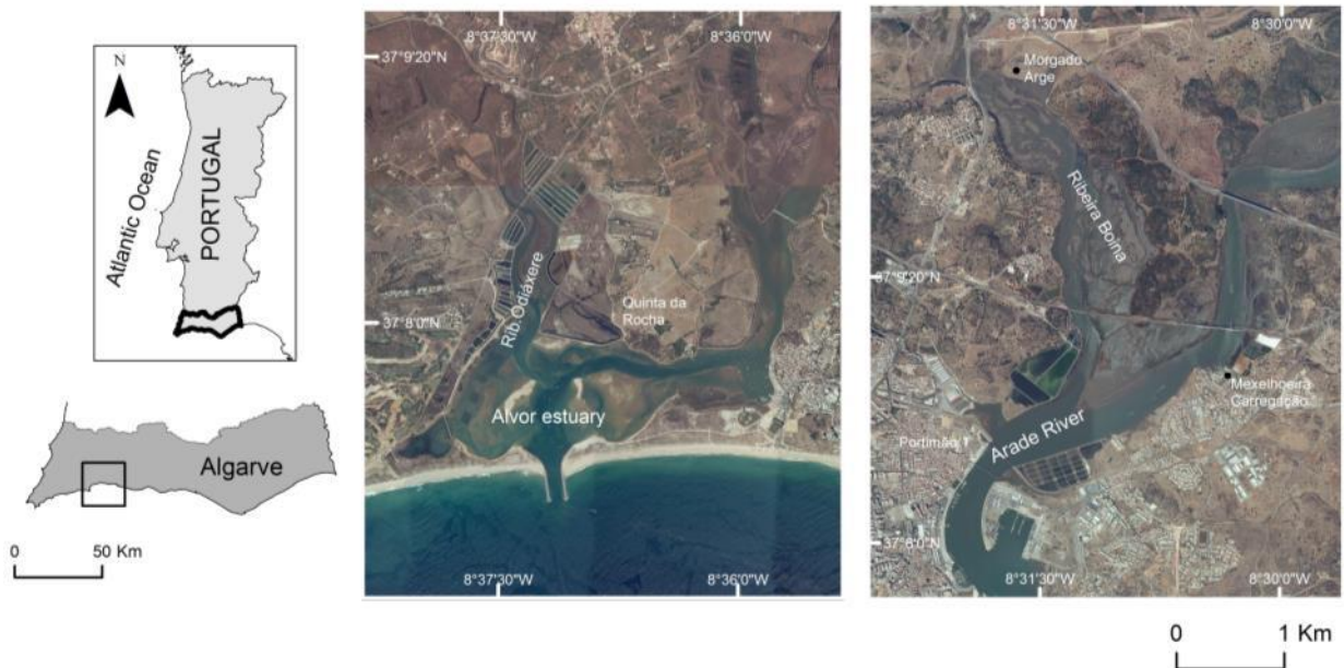
Figure 1. The location of the study areas in the Algarve, southern Portugal (left) and aerial photographs taken in 2010 showing the Alvor estuary (centre) and the Arade River (right).

The Alvor estuary (Ria de Alvor) and the marshes of the Arade river (and the tributary Ribeira de Boia) are located in the Portimão municipality (Algarve, southern Portugal, Fig.1). The area has temperate Mediterranean climate, showing mean annual temperature around 17°C (at Faro Airport, IGP, 2005) and annual mean precipitation at the coast between 400 mm and 500 mm, with the wet season occurring from October to April (Ribeiro et al., 1997). Alvor is a tidal lagoon dominated by sandy sediments of maritime origin set in a mesotidal environment with little freshwater input. The Arade River mouth is a drowned river valley subjected to tidal influence from the mouth to 13 km upstream.