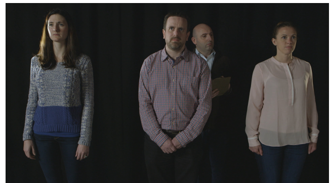
Figure 2: Imaging personas as a security design solution