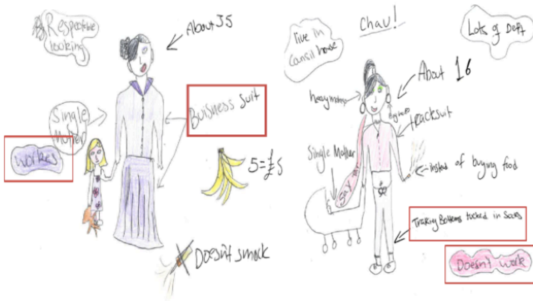
Figure 2 Illustrations from workshop