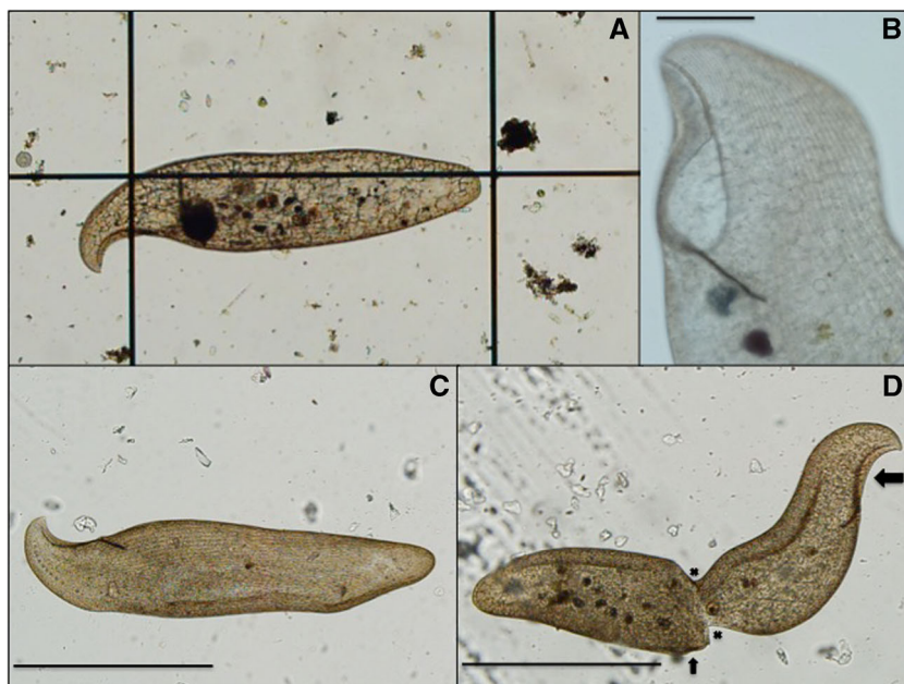
Fig. 2 a View of living Loxodes rex . Center vertical lines of the chamber are 1000 \mu\text{m} apart. b Open oral aperture (top left) with ciliary row detail. Scale bar 100 \mu\text{m} . c Swimming L. rex with numerous ciliary rows. Note the row of Müller bodies at the bottom left which runs parallel to the oral aperture. Scale bar 500 \mu\text{m} . d Image of a dividing cell. The cell at the right is the original cell, and the cell at the left is the newly formed cell, with division area indicated by X's. Note difference in oral aperture development from complete at the right (large arrow) to new formation at the middle right (small arrow). Scale bar 500 \mu\text{m}

Initial studies revealed the presence of an abundant ciliate population in the water samples. The giant ciliate observed was flattened, with a concave and anterior oral aperture situated on a rim, forming a beak-like hook so that the ciliate has a clear left and right side (Figs. 1 and 2). The right side is ciliated, with dikinetids arranged in bipolar kineties; the left