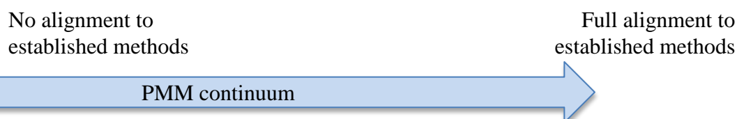
Figure 2. The PMM continuum

One tactic used by organisations to inhibit PMM complexity has typically been to customise how projects are managed using a combination, in varying degrees, of established PMMs eg PMBOK, experience of those involved and the characteristics of the projects undertaken. This approach has led many organisations to implement a customised PMM that is believed to maximise the benefits of a structured way of working while at the same time minimising the perceived disadvantages of the established methods. Figure 2 shows how the PMM used by an organisation can be plotted on a continuum that begins with a totally customised PMM and ends with a way of working that precisely follows a structured method such as PRINCE2.