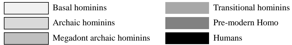
Figure 1. Summary of hominin fossil species and grades known to date (after Wood 2010; Berger et al. 2010; Carbonell et al. 2008).