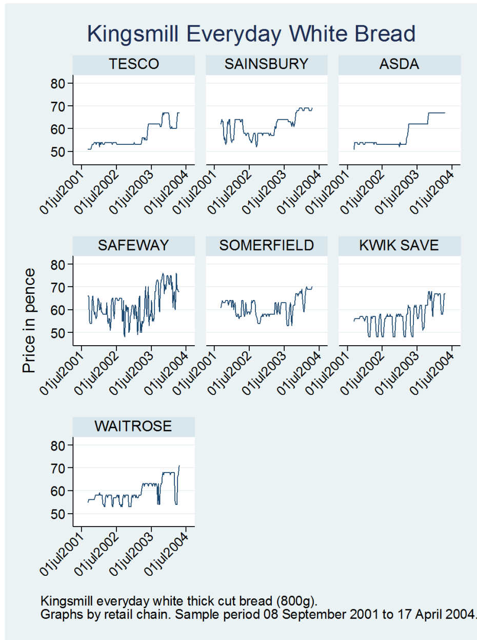
Figure 1: Weekly Prices (pence) of Kingsmill Everyday White Bread across All Major Food Retailers

and Midrigan (2012), Guimaraes and Sheedy (2011) and Coibion et al. (2013) address these issues. To account for this, recent empirical studies employing high-frequency price data seek to remove sales from price series.