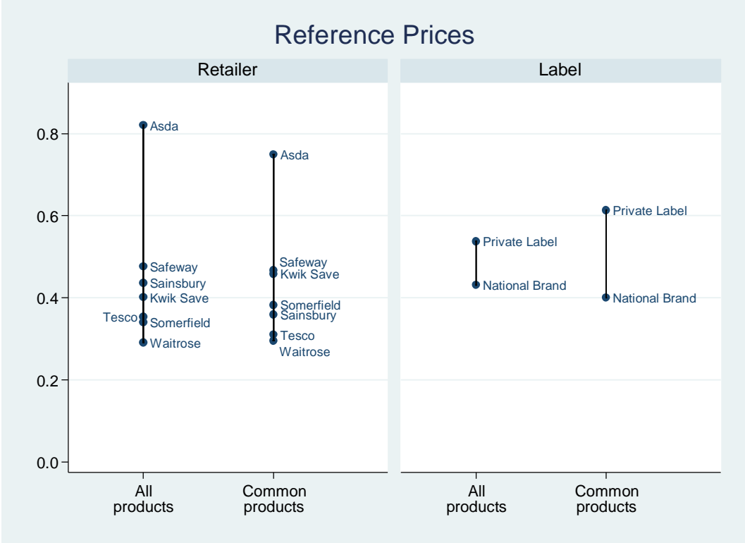
Figure 2: Contribution of Rolling Reference Prices and Sales in Price Variation ( R^2 ) by Retailer and Label