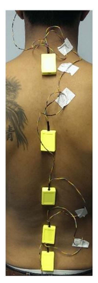
Figure 1 Inertial sensor placements over the spinous processes of C7, T7, T12, L3 and S1.

Participants were instrumented with a string of inertial sensors (THETAMetrix, Waterlooville, UK) adhered to the skin on the forehead and overlying the spinous processes of C7, T7, T12, L3 and S1 (figure 1). Each sensor was comprised of a triaxial accelerometer, gyroscope and magnetometer, and sampled at 40 Hz/sensor. The