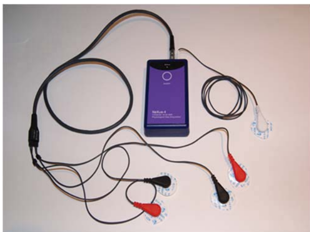
Fig. 2 Surface-placed electrodes to portable electromyograph

Exclusion criteria were: chronic fatigue, diabetes, fibromyalgia, heart condition, high blood pressure, hormone replacement therapy, multiples sclerosis, and stroke. Between- and within-subjects comparisons were made using t-tests and correlations using the SPSS package. This enabled a comparison to be made between yawner and non-yawner participants as well as between rest status and yawning episodes.