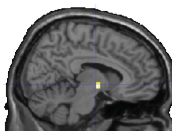
Fig. 4 Hypothalamus activity for mental task

In terms of cortical activity, the brain-stem and hypothalamus regions appear to be more active during the