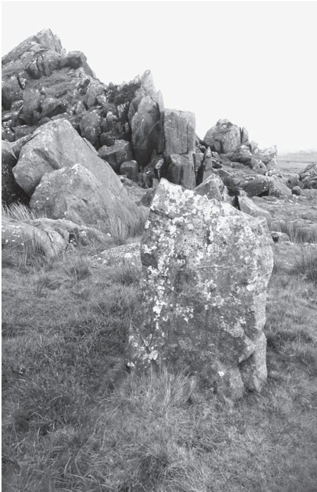
Ill. 5: Standing stones on Carn Menyn in the Preseli Hills of Wales, UK.

wooden wheels in northwest Europe in the late fourth millennium BCE 60 might have made the task easier. It is also possible that, for short distances at least, Bluestone pillars could have been carried on wooden stretchers or carrying-frames that spread the weight and allow a group of bearers to do their work. Gresham and Irvine 61 have argued that routeways into the uplands of Wales were often marked in prehistoric and later times by standing stones, some of which still survive in the landscape. Such a stone lies on the central part of one of the dolerite sources on Carn Menyn at the head of a route down to the Cleddau Valley (Ill. 5), and further standing stones have been recorded between the Preseli Hills and the coast as well as along possible eastwards-leading over-land routes. 62 At Rhos-y-Clegyrn to the south of the Preseli Hills