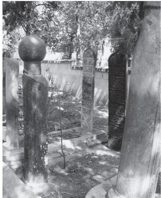
Ill. 1: Grave with green marker-stones in a cemetery at Şanlıurfa, Turkey.

The Kaaba and Well of Zamzam are the central features of a much wider ritual landscape that extends outwards in all directions. Getting to Mecca traditionally involved three main routes – the Egyptian route from the west, the Syrian Route from the north, and the Iraqi route from the east – as well as numerous other subsidiary routes some of which included passage by