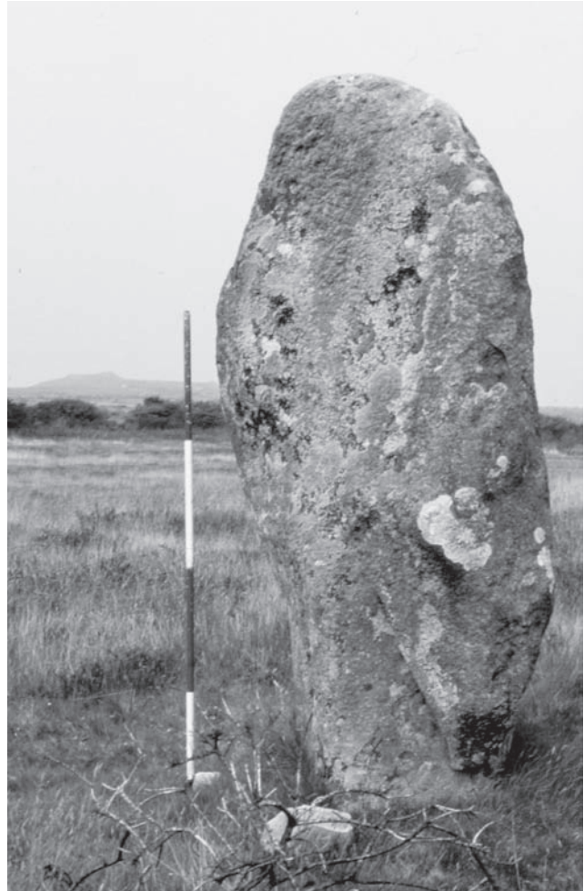
Ill. 6: Standing stone at Rhos-y-Clegyrn, Pembrokeshire, UK.

wooden wheels in northwest Europe in the late fourth millennium BCE 60 might have made the task easier. It is also possible that, for short distances at least, Bluestone pillars could have been carried on wooden stretchers or carrying-frames that spread the weight and allow a group of bearers to do their work. Gresham and Irvine 61 have argued that routeways into the uplands of Wales were often marked in prehistoric and later times by standing stones, some of which still survive in the landscape. Such a stone lies on the central part of one of the dolerite sources on Carn Menyn at the head of a route down to the Cleddau Valley (Ill. 5), and further standing stones have been recorded between the Preseli Hills and the coast as well as along possible eastwards-leading over-land routes. 62 At Rhos-y-Clegyrn to the south of the Preseli Hills