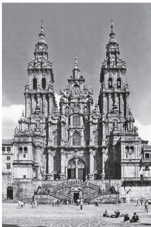
Ill. 2: Cathedral of St James the Greater, Santiago de Compostela, Spain.

in 1985; 28 the routes leading to Santiago were declared a Cultural Route by the Council of Europe in 1987. 29