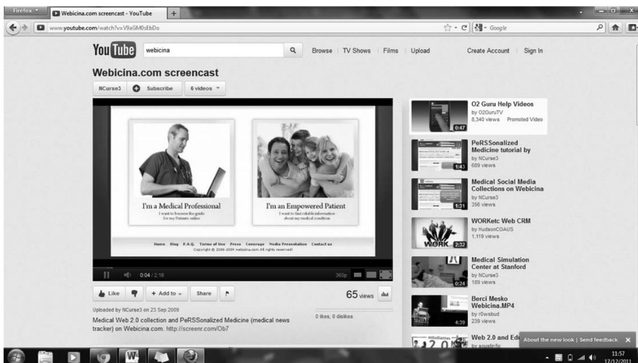
Figure 3 YouTube interface