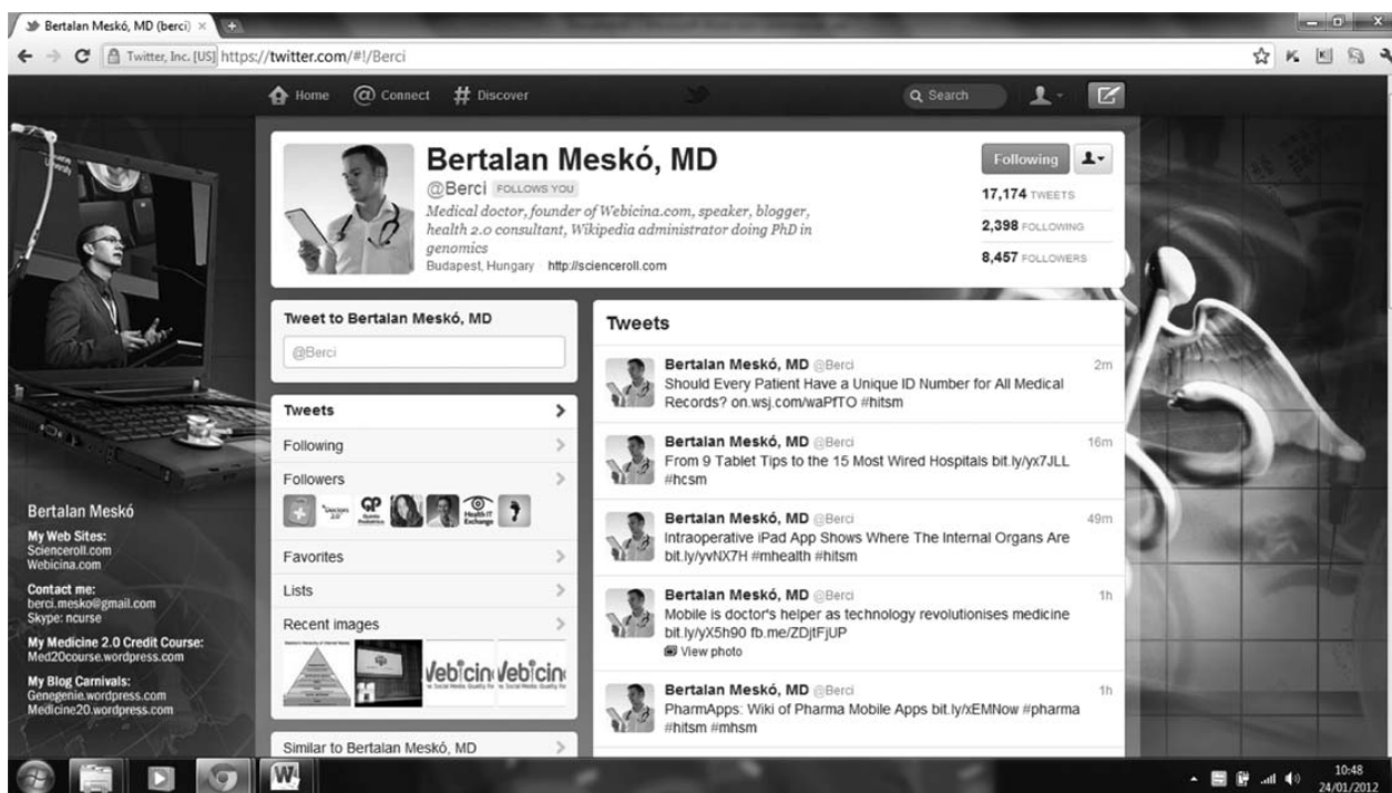
Figure 2 A typical Twitter page

In order to be attractive to the intended audience, to encourage the maximum number of visitors to the page, and to prevent the page from becoming redundant, the Facebook page needs to be regularly updated with new information. Such updates may include details of the services you provide, information regarding physiotherapy techniques and modalities, and images/videos of the clinic. Posting testimonials from patients may be an added advantage in building a positive reputation on the quality