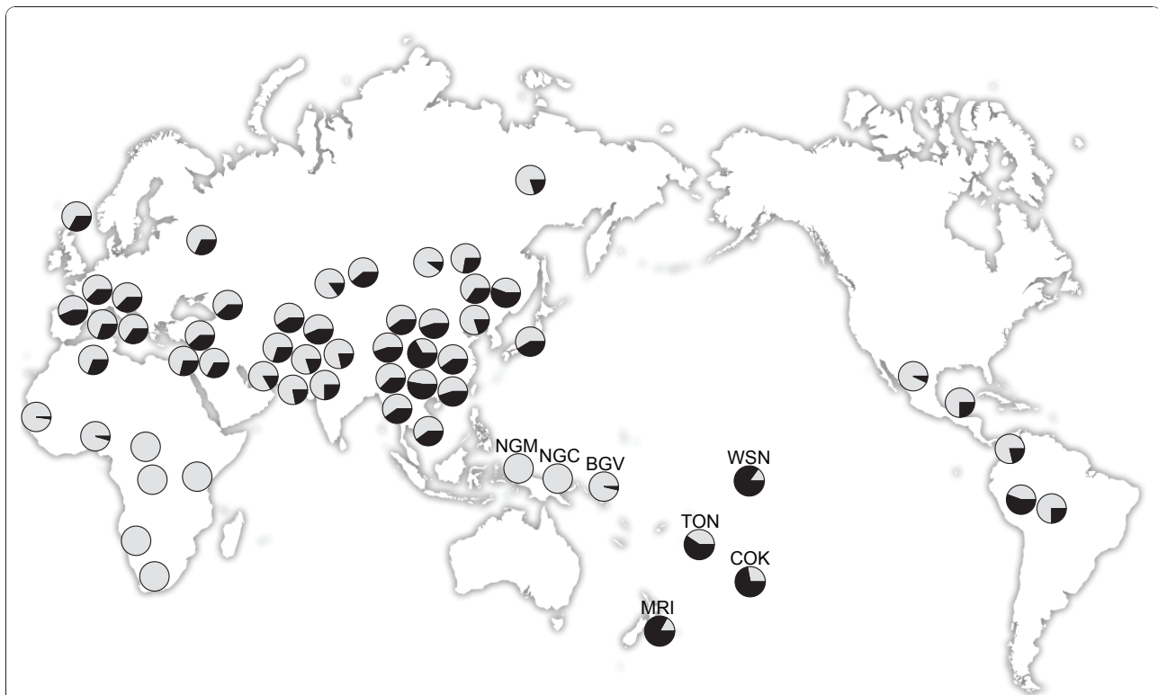
Figure 2 Worldwide frequency distribution of the 482Ser risk allele. The frequency of the 482Ser risk allele in each population is indicated in black. Frequencies are shown for the 53 populations from the CEPH Human Genome Diversity Panel and 6 additional populations. The raw genotype and allele frequency data for these populations can be found in Additional File 1, Table S1. The populations most relevant to the present study are abbreviated as follows: NGM, New Guinea samples from Myles et al. (2007); NGC, New Guinea samples from the CEPH-HGDP; BGV, Bougainville; TON, Tonga; WSN, Western Samoa and Niue; COK, Cook Islands; MRI, Maori.

( P = 0.46 ). In the Maori, however, we found no significant associations between Gly482Ser genotypes and age and sex adjusted BMI (Table 1 and Figure 1). When considering the populations together and including population as a covariate, we also find no evidence of association ( P = 0.56 ). Despite having a lower BMI, we find that the Maori have a higher PPARGC1A risk allele frequency than the Tongans. Although this observation does not support a causal relationship between the PPARGC1A risk allele and BMI, it can be explained by several confounding factors including sampling biases and environmental differences between populations.