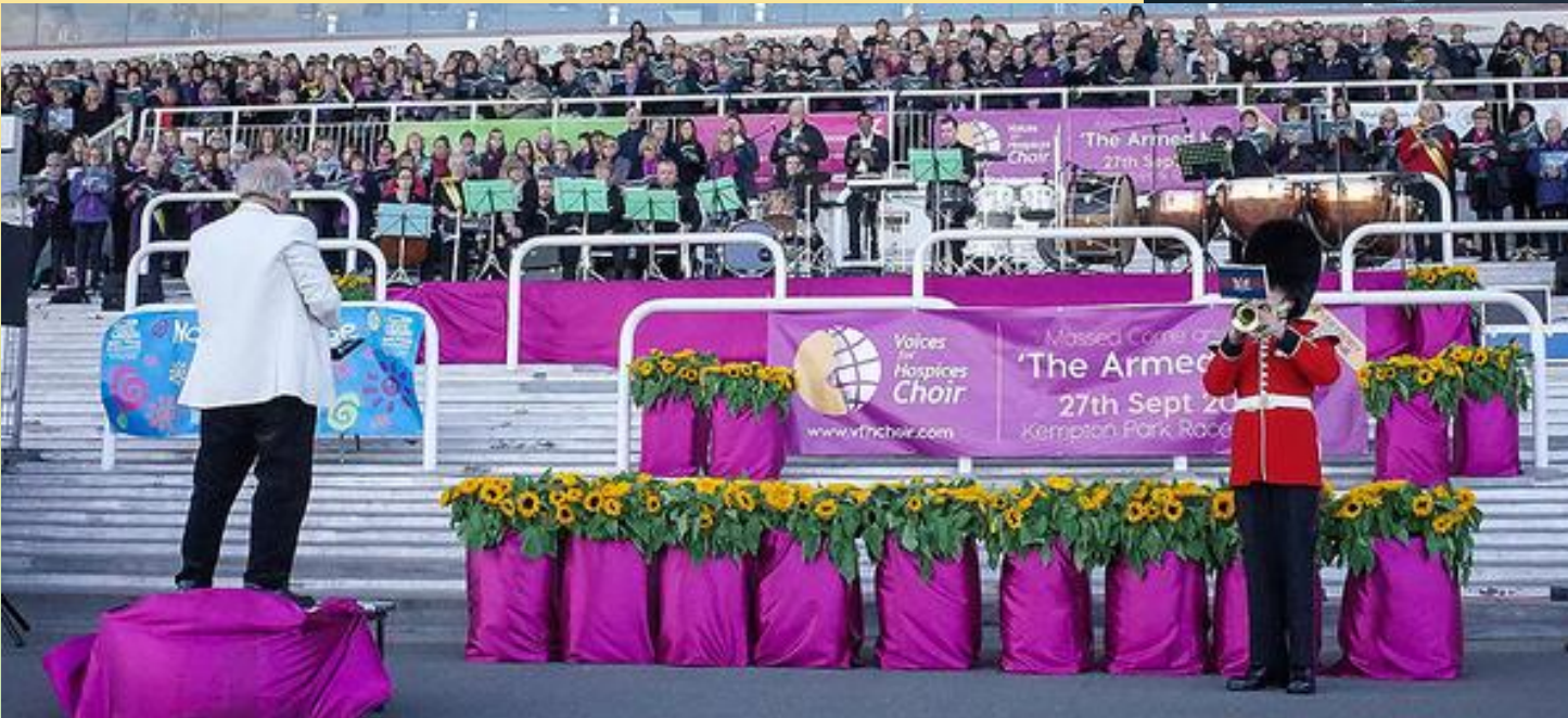
The Armed Man: A Mass For Peace