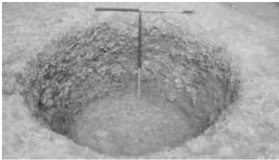
Figure 4: Iron Age storage pit 512 after excavation and clearance. An example of an unweathered pit backfilled immediately after it went out of use. Scale divisions 0.5m (Robin Dumbreck)

(Russell et al 2014, 219), the term 'storage pit' is traditionally applied to such features when discussed in the archaeological literature, although no definitive evidence as to the nature of storage has yet been found. Presumably, if purely functional in purpose, the pits may have been designed to hold a particular type of foodstuff, such as dairy produce, in the manner of a cold store, or grain, with perhaps each pit or silo storing the surplus produce of a single agricultural cycle. A frequent form of pit combination similar to ones found at Gussage (Wainwright 1979) comprising a larger pit and a smaller shallower pit directly adjoining, was observed in both trenches.