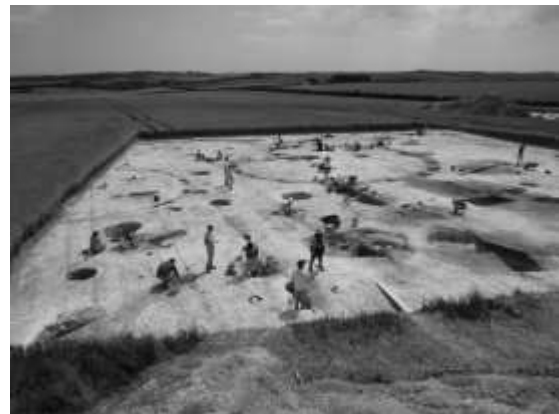
Figure 3: Trench B, looking due south, under excavation in 2015, showing a variety of storage pits and quarry pits together with the foundations of two Iron Age roundhouses (Miles Russell)

In total, eighteen cylindrical pits, measuring between 0.5 and 2.5m in depth, were fully examined within the two trenches, some of which were backfilled shortly after they went out of use and some allowed to weather for a period of time before being backfilled (Figures 4 and 5). As has already been noticed (Cunliffe 1992), especially with regard to the examination of features within the Winterborne Kingston banjo enclosure