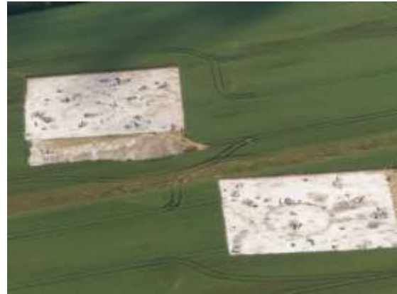
Figure 2: An aerial photograph, looking west, showing the two main areas of archaeological investigation in 2015. Trench A is in the background and Trench B in the foreground (Jo and Sue Crane).

contemporary with the building, although few traces of other internal structuration, such as postholes for the ringbeam, partition walls or lesser forms of furniture, were recorded. It is possible, of course, that such features have been removed through subsequent agricultural attrition.