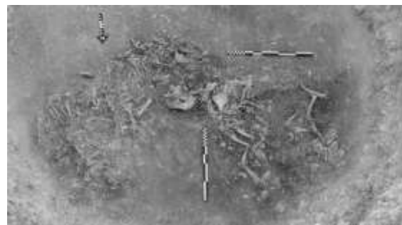
Figure 7: A deposit comprising the articulated remains of three pigs, recovered from the mid-fill of Iron Age storage pit 073. Scale major divisions 10cm (Robin Dumbreck).

Beyond the area of the roundhouse ring-gullies recorded, at least seven areas of quarrying and additional activity were