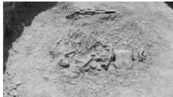
Figure 6: A deposit comprising the articulated remains of a sheep, set down with the skull of a cow recovered from mid-fill of Iron Age storage pit 049. Scale major divisions 10cm.

clay loomweights, quern stones, upended and perforated pots or the inverted skulls of cow or horse and in one case an articulated horse forelimb extended with cow bone and an associated cow rib. Three of the pits within trench A appear to have received secondary deposits placed on top of weathering cone fills, presumably at some significant time after formal pit abandonment. One deposit comprised the articulated remains of a sheep, set down with the skull of a cow placed directly against its posterior (Figure 6), a second consisted of the fully articulated remains of three pigs, presumably all killed together and buried within pit fill as an offering (Figure 7). After these placed deposits were put in either at the bottom or in the mid-fill the pits they were then sealed by fully backfilling the pit in one operation.