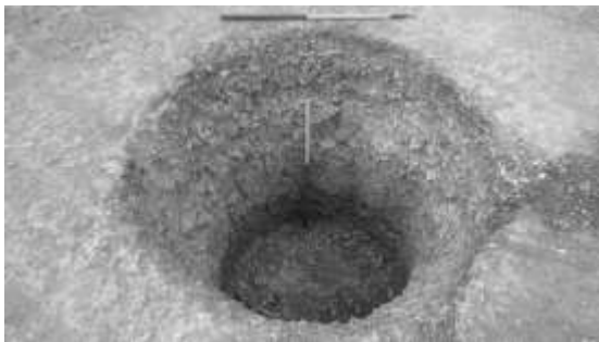
Figure 5: Iron Age storage pit 559 after excavation and clearance, an example of a weathered pit. Scale divisions 0.5m

At the point of disuse, the majority of pits, where bottomed in the course of the 2015 excavation, were found to have contained a special, placed deposit. The nature of placed deposits varied from pit to pit, one comprising the fully articulated remains of a dog, whilst others contained deposits of triangular, baked