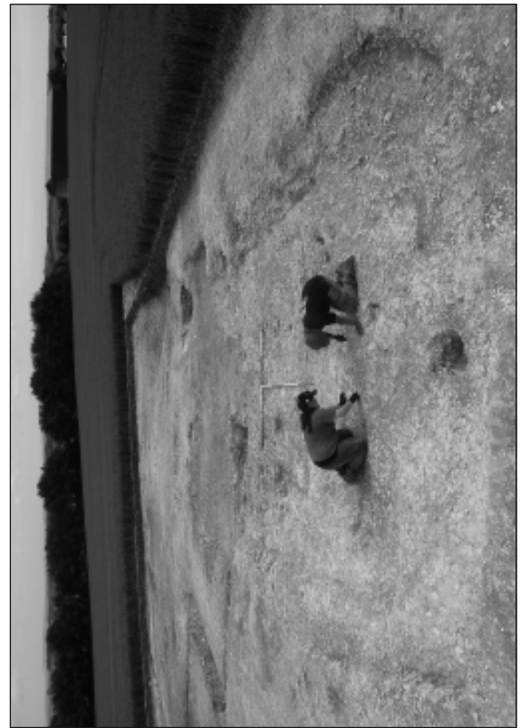
Figure 3: The late or sub Roman long house under excavation in 2013, looking south.