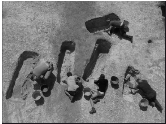
Figure 6: The five graves at the centre of the small late- or sub-Roman cemetery under excavation in 2014, looking west (Miles Russell).

V-shaped late Roman ditch (Fig. 5) lay to the south of (outside) the later Bronze Age settlement. Five, roughly east – west aligned graves were identified within the space defined by the ditch. Each grave contained an extended inhumation, lying on their back with their heads to the east (Fig. 6). The burials comprised two mature adult males, two mature adult females and an elderly female whilst the disturbed remains of at least two neonates were also found in the fill of the