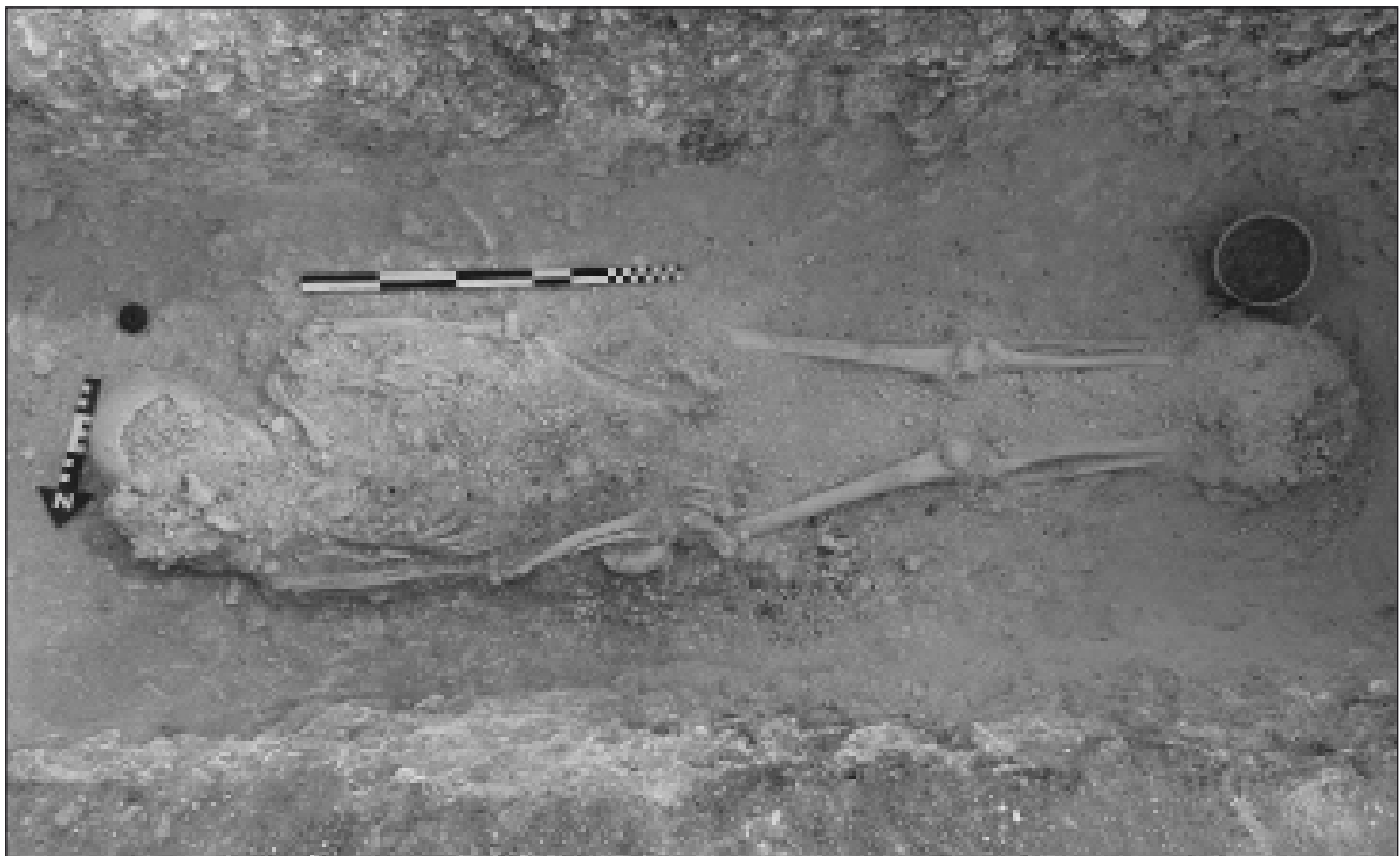
Figure 7: A formal, extended inhumation of an adult female from the late- or sub-Roman cemetery. The outline of the coffin, together with coffin nails, is evident around the body whilst a small spindle whorl has been placed by the head and a late-fourth-century stamp impressed New Forest Ware bowl is by the feet (Miles Russell).

surrounding ditch. The adult burials had all originally been placed in coffins, iron coffin-nails surrounding the bodies. Few grave goods were identified, the two males had been buried with hob-nailed boots, the three females with small spindle whorls. One of the adult females had also been laid to rest with a heavily abraded, stamp-impressed colour coated New Forest Ware bowl (Fig. 7), manufactured sometime in the mid to late fourth century. The nature of the burial rite and