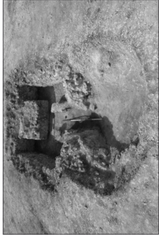
Figure 4: The late- or sub-Roman H-shaped corn drier/ malting oven, built using stone and tile material recycled from the villa, looking north from the stoking chamber and flue (Miles Russell).