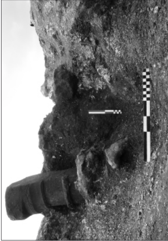
Figure 2: A carved Roman 'dwarf' column cannibalised from the fourth-century villa and reused as part of the flue to a late or sub Roman kiln (Miles Russell).