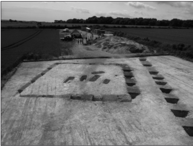
Figure 5: The late- or sub-Roman square enclosure / barrow of Trench 1, with its five central graves, under excavation in 2014. The linear ditch to the right of shot is part of a larger later Bronze Age settlement enclosure.