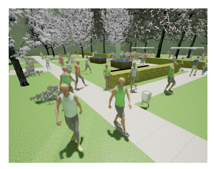
Figure 1: Example of a MISER configuration setup with virtual background agents evolving in an open-space virtual world.

Copyright © 2017, International Foundation for Autonomous Agents and Multiagent Systems (www.ifaamas.org). All rights reserved.