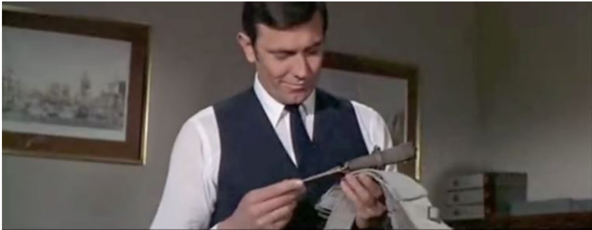
IMAGE 2: Lazenby and Honey Rider's knife connects Dr. No with OHMSS

stating that this is 'an error and it must be treated as that ... an error on behalf of the film makers...does this mean that Blofeld is also a codename?'