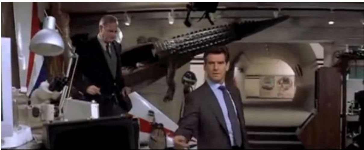
INAGE 4: Q’s Workshop from Die Another Day .