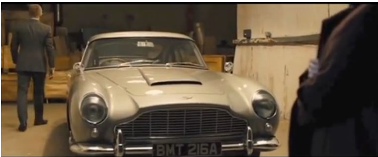
IMAGE 6: A guest appearance from the classic Bond car first seen in Goldfinger