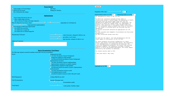
Figure 2: Interactive Grading Tool (included with this paper as supplemental material): Sliders and buttons mapped to the assessment criteria generate detailed feedback that can be copied and pasted into the coursework feedback forms used in our faculty.

The assessment criteria for the assignment that directly relate to the quality of the source code and usability of the program – including effective use of functional decomposition, relevant control structures and data structures – count for 50% of the assignment grade.