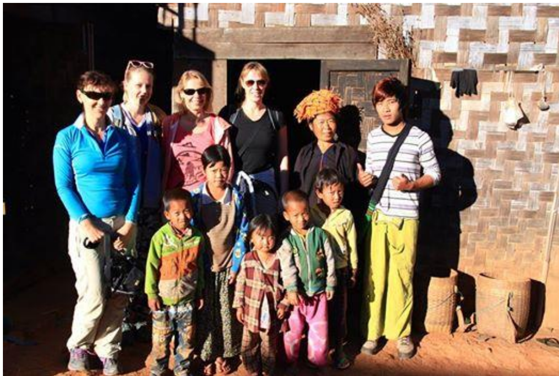
At the wedding reception