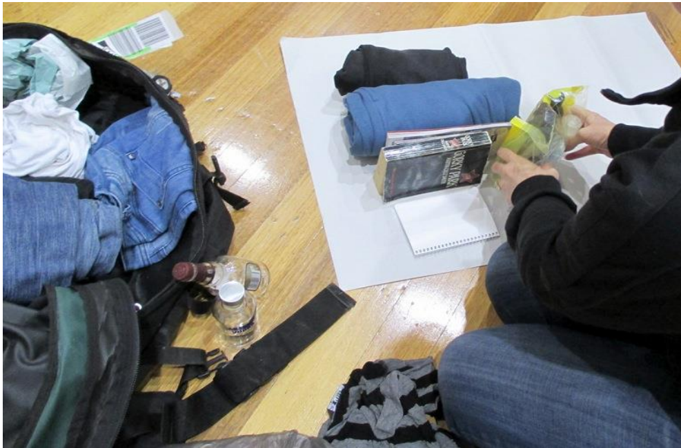
Above: “Diagramming the packing process”, 2013.

Above: “Diagramming the packing process”, installed in Phoenix Gallery, Melbourne, September 2013.