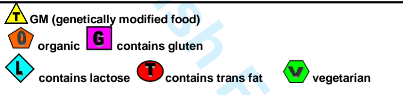
Fig1. Menu labelling formats tested by experimental condition.

Ingredients: potato, hydrogenated fat, salt.