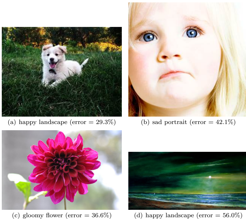
Fig. 3 Failure cases of our experiments. Captions denote the keywords used for image retrieval. Error means the distance between the coordinates of ground truth and prediction result on the AV space.

timent recognition techniques [Park et al(2013)Park, Jang, Chung, and Kim] or crowdsourcing services, such as MTurk [Ipeirotis(2010)]. This will assist in obtaining more statistically reliable evaluation results.