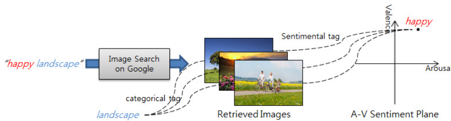
Fig. 1 Image Acquisition Process with Ground Truth Sentimental Data.

In many cases, duplicate images might be retrieved, and thus they must be removed. However, finding the exact same images from those collected requires too heavy computation. Instead, we prevent a heavy load in the duplicated reduction process by finding duplicate images in low resolution. For this, we employ the Antipole tree [Cantone et al(2005)Cantone, Ferro, Pulvirenti, Recupero, and Shasha], and use a thumbnail image resized to 16 16 as an index for the image. By inserting and searching thumbnail images, we find the same images rapidly. If a duplicate image is found for the same keyword, we remove the duplicate image. Otherwise, if a duplicate is found for other keywords, we simply add the keyword to the image.