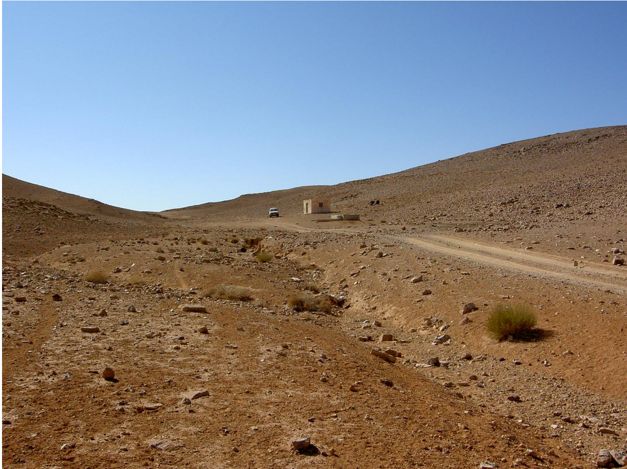
Figure 1. Sample scene of the type used in the study. In this example, observers must examine the ground for signs of disturbance, and check the building and surrounding hillside for locations where an opposing force might choose to launch an attack. Note that this image does not contain any threats/risks.

There exists an extensive body of prior research that has examined the role that experience and expertise plays upon visual cognitive processes (Reingold & Sheridan, 2011). Typically these studies have found that increasing experience with a given task improves performance substantially. The key issue that arises from this shift in performance is how experience improves performance: is it through improving information-sampling (i.e., the objects