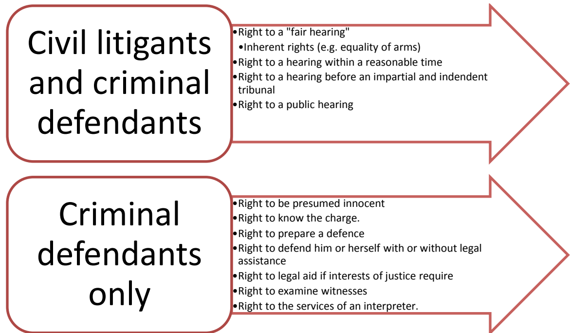
Fig 7.2 summarises the rights of civil litigants and criminal defendants.

Having considered the kinds of hearing to which article 6 applies, we now should discuss the content of those rights.