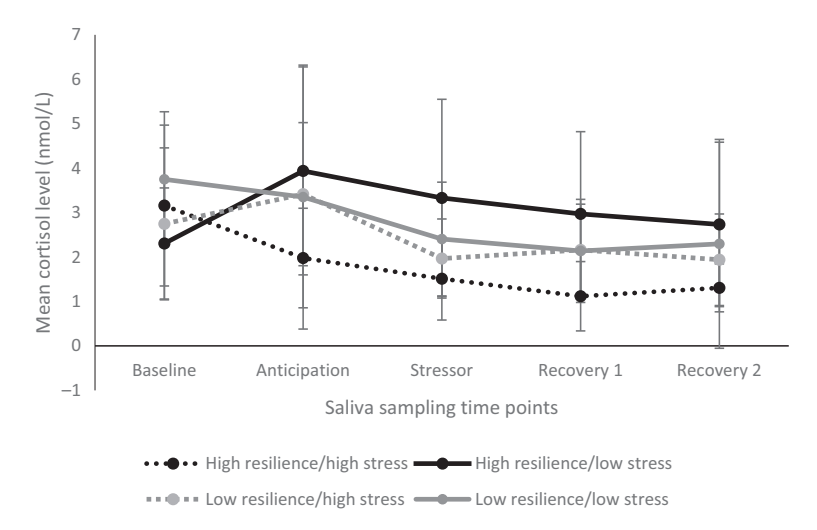
Figure 1. Salivary cortisol levels across the five time points for the four prior stress-resilience groups (error bars display standard error of the mean).