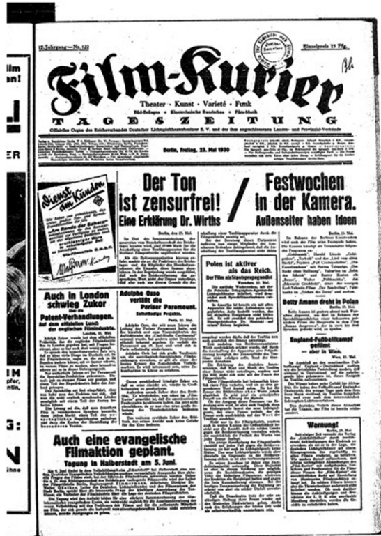
Figure 8: Film-Kurier , 23 May 1930

had publicly declared that only the visual component of films was subject to censorship, not dialogue or music (Anon, 1930b).