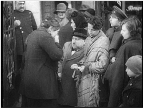
Figure 4: Weeping woman attempts to jump queue. DVD screen grab from Westfront 1918

Following the argument in the food queue, the background music cuts from drumming to the chorus of a well-known tune, ‘In der Heimat, da gibt’s ein Wiedersehen’ (‘We’ll meet again back home’), sung off-screen by the marching conscripts. Through the song’s lyrics, the soundtrack generates a painfully ironic emotional contrast between desperate civilian misery and the cheerful tune extolling the joys of an idealised homeland or ‘ Heimat ’, an emotionally charged concept in German culture since the late nineteenth century. Another level of irony is supplied by the shot’s revelation that the butcher shop queue includes Karl’s mother, who spots her son but feels unable to leave the queue to greet him.