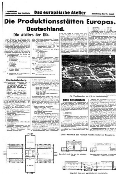
Figure 2: Film-Kurier , 15 August 1930

The transition's progress is all the more surprising in light of the renewed economic pressures faced by the Weimar Republic. After emerging from the initial post-war inflationary debacle, the country had stabilised for most of the 1920s, before being plunged into new difficulties with the global financial crisis triggered by the US stock market collapse of 1929. Rising production costs associated with sound film resulted in a seismic change in the filmmaking infrastructure of the Weimar Republic (Korte, 1998, p.448). It created a landscape in which major players were better equipped to weather the storm: many independent cinema chains and small film companies could not raise funds to convert to sound. Emerging as Germany's leading film studio, Ufa had recognised that sound technology would warrant investment and constructed a purpose-built sound stage complex laid out on a cross-shaped foundation. Located at the centre of Ufa's new Tonkreuz was its optical sound hub, which could simultaneously process the recording tracks from each of its four separate sound stages. Film-Kurier published a special supplement in August 1930, which assessed the infrastructure of European film studios and highlighted the recent development at Ufa's Babelsberg studios (see Figure 2).