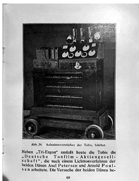
Figure 3: Tobis mobile amplifier (Umbuhr & Wollenberg, 1930, p.69)

Aside from issues of sound technology, Westfront 1918 also shows itself a product of an industry in flux through the format of its film script – a production element then undergoing a metamorphosis (Kagelmann & Keiner, 2014, p.91). Unusually, the Westfront script was printed in landscape format, using separate columns for sound notes, as well as instructions regarding camera positions and dialogue lines. Indicating that this layout marked a transitional stage in the evolution of sound film scripts, Pabst's next script, for Kameradschaft (1931), followed a different format, with sound notes integrated into the dialogue column (Kagelmann & Keiner, 2014, p.112, n.56). The arrival of sound not only affected the layout of film scripts, it also profoundly altered the involvement of writers in shaping a film. Sound gave writers the opportunity to experiment with more complex character development as well as with semantics and the shaping of dialogue lines. On Westfront , dialogue was created by Peter Martin Lampel, while the script was adapted for the screen by Ladislaus Vajda (involved in every Pabst film script between 1927 and 1932). Filmmakers themselves could add further depth to a writer's characters by working with actors on accents, dialect, and intonation – opportunities which Pabst seized upon in this film.