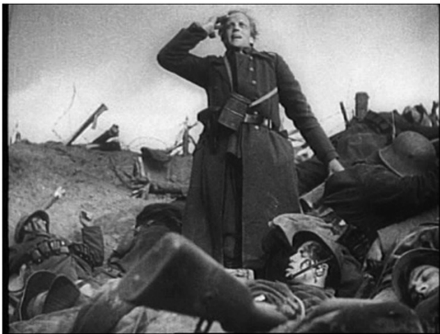
Figure 5: DVD screen grab from Westfront 1918

Sound added a deeper emotional dimension to the film's portrayal of warfare, demonstrated in miniature in a scene towards the end of the film where the off-screen cries for help by an injured and dying French soldier are heard by the Bavarian and by Karl, who has just returned from his unhappy experience on home leave. Though the Frenchman's screams never resonate loudly on the soundtrack, they insinuate themselves enough to needle the already shaken Karl. He attempts to leave the relative safety of the German trench to attend to the enemy soldier, while the Bavarian reasons that it is the responsibility of French soldiers on the other side to rescue their comrade from no man's land. For Karl, with his own emotional state intensified by his home leave as well as news that a close comrade has been killed, the French soldier's screams perhaps externalise his own emotional pain.