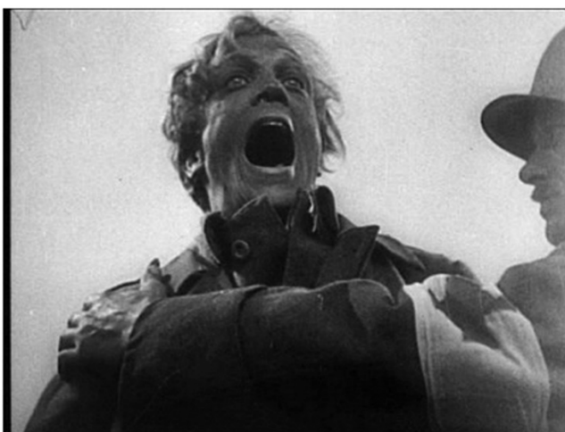
Figure 6: DVD screen grab from Westfront 1918