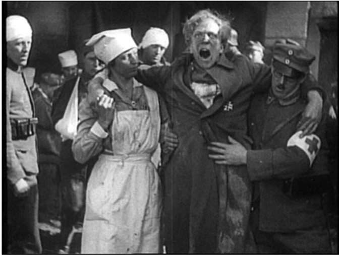
Figure 7: DVD screen grab from Westfront 1918

The dying soldier's screams fade into insignificance compared to the sounds of human agony famously heard in the film's final section, following the devastating battle scene in which Karl and the Bavarian are seriously wounded. Throughout the film the character of the Lieutenant had been that of an experienced soldier, fully focused on his duties, rigorously obeying all orders issued by the Imperial army's leadership. His attitude of complete military devotion crumples after the disastrous battle. Crazy but still dutiful, he is seen rising up from a pile of dead soldiers from both sides of the conflict, jumping to attention again, his militarism reduced to hysterically screaming 'Hoorah', as if the gross carnage signified victory.