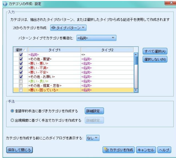
Fig. 2. Categories setting