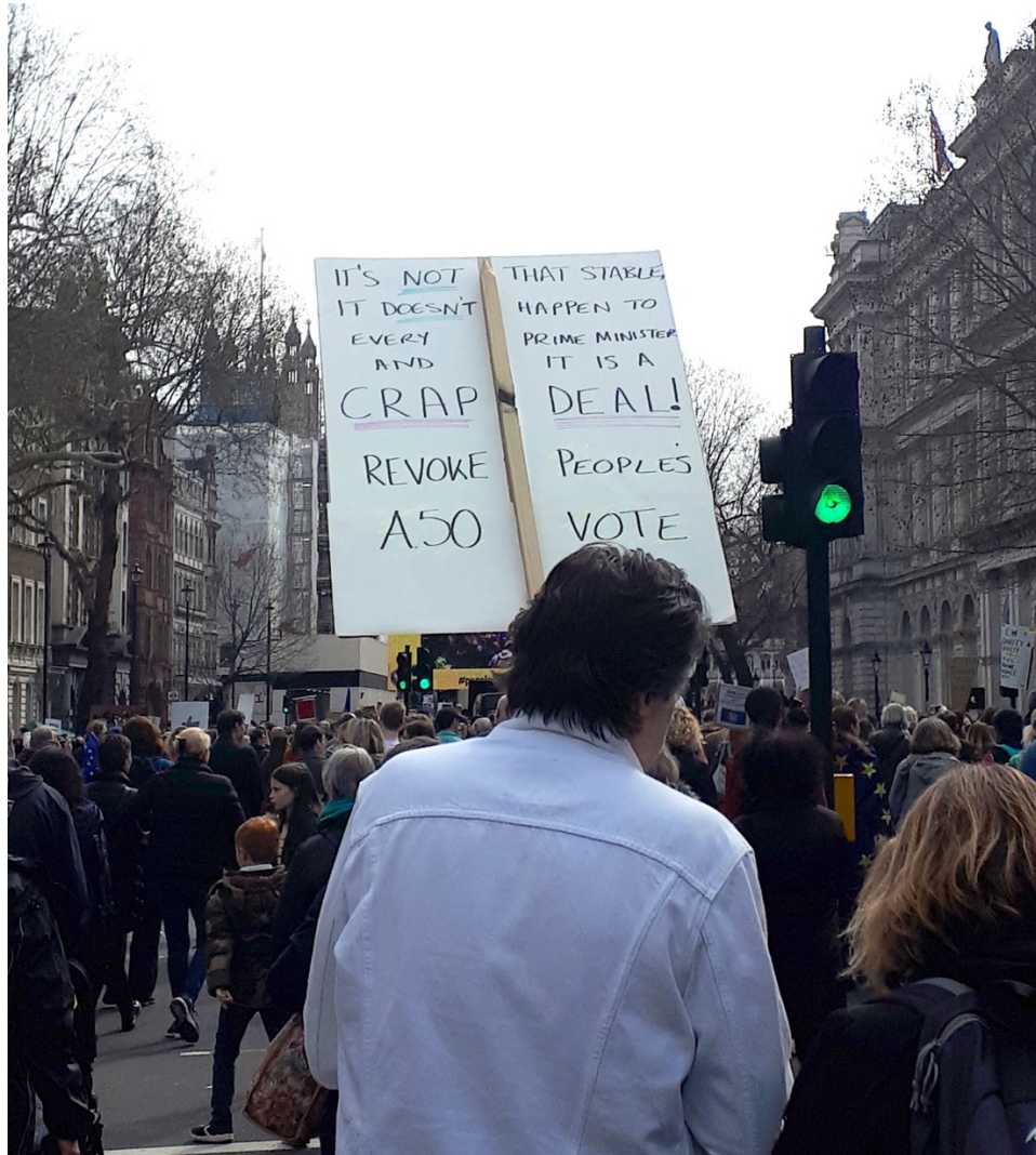
Fig. 2: Sign referencing American sitcom Friends seen at the Put It To The People march, London, March 2019.

question “Do you want to be left alone on a small island with these men?” This alludes to both the obvious fact that Britain is an island, and insinuates that being left alone with these men would be a disappointing and potentially non-consensual sexual experience.