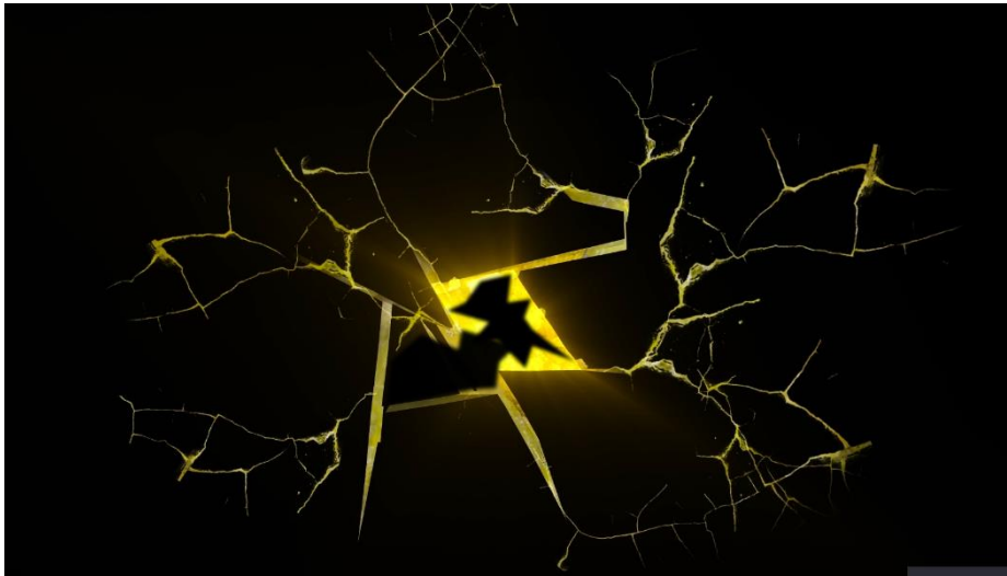
Figure 2: The Crack, Brainwave Art piece, Oliver Gingrich 2019

Audiences are invited to remember their loved ones, a neighbour they might have lost, by looking at a canvas, while their thoughts materialise as a subtly changing stream of colour. The piece was first exhibited a week after the fire, at Maxilla Space, and remained relevant a year due to the vicinity of the exhibition to the Grenfell site as well as the invited audience, predominantly members of the local community.