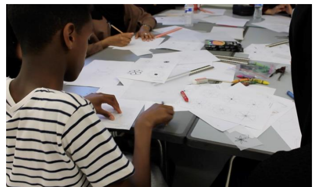
Figure 1: This is a legend. Caption to go below figure

The three case studies here presented offer some examples of how productive the intersection between digital art and participatory art could be. These projects aims to raise awareness for pressing societal issues working directly with local residents, local authority and art institutions in order to open up a discussion that helps to build connections and bring people together as well as it stimulates to find out individual and communal strategies to tackle pressing issues in their environment. Technological tools used in the art projects facilitate awareness of how and why those issues are critical through heightening subjective perceptions and building up a collective understanding supporting citizen empowerment in the decision-making process.