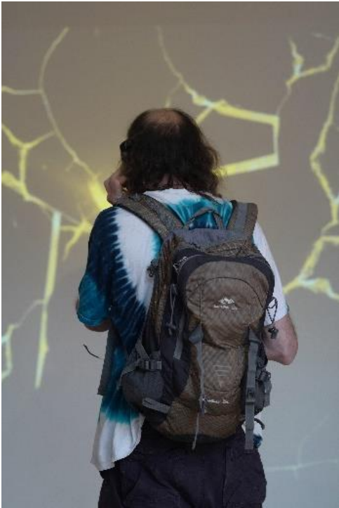
Figure 3: The Crack , Intelligent Matter Exhibition at ACAVA's Maxilla Space

Whenever concentration drops below a certain threshold, the crack disappears, and participants have to trigger the crack from scratch. This mechanism supports a sustained concentration, something that is easier to achieve for students than teachers, spiking a new form of competition in the class room. More than the gamified experience, the students showed interest in the conceptual background of the piece, it's raison d'être .