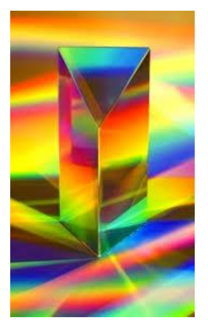
Figure 1: Prism and light refractions

To build on the efficacy, our novel proposal is a closeknit integration of NeuroCreate's existing neurofeedback products and new collaborative audio-visual strategies to create a real-time Flow-training participatory art installation which improves neuro-cognitive performance. Attaining Flow states is a proactive approach to improve resilience via neuroplasticity to actively mitigate the processes underpinning stress and its effects. Relaxation is a more passive approach that deals with the symptoms of stress rather than modify its underlying neuronal mechanisms.