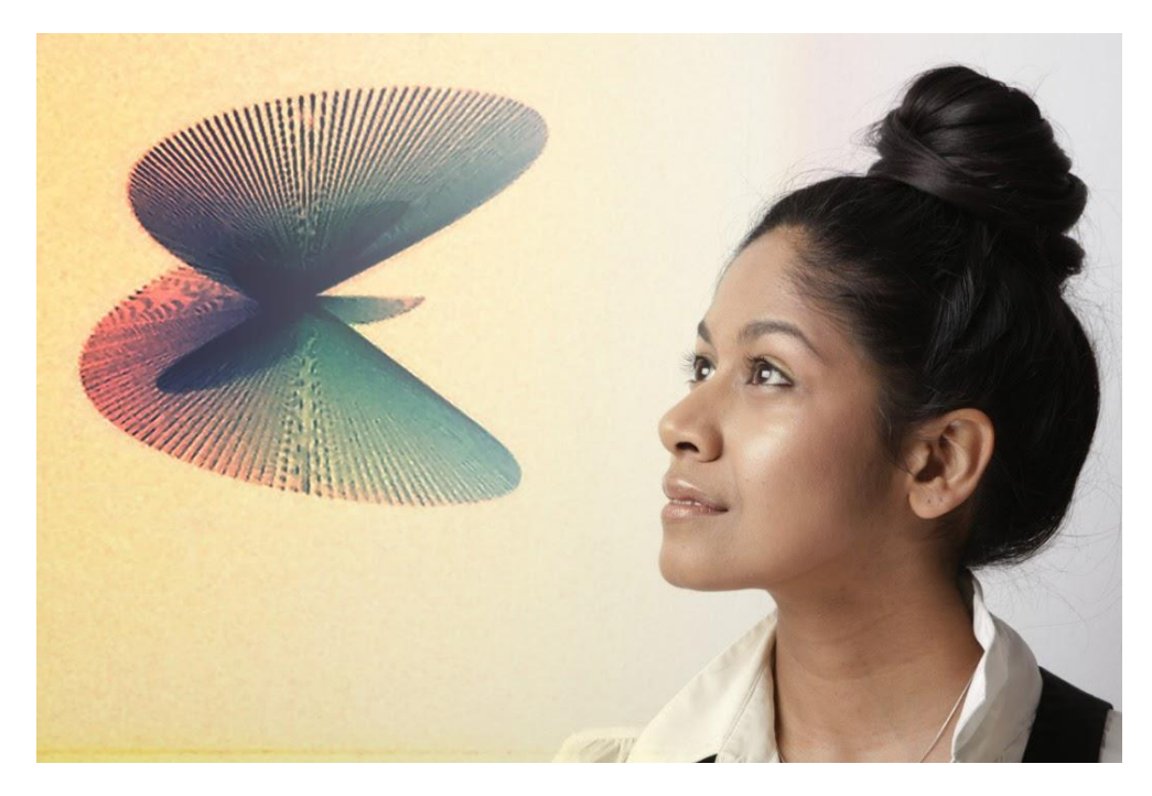
Figure 7: Zeitgeist and Previsualisation

The piece is egalitarian, in that all participants contribute to the experience at equal measures, and it turns the audience into a performer in their own right. The combination between AI, participatory art, and brainwave human computer interface is in itself unique, fusing the latest development in brainwave research with the potential of machine learning.