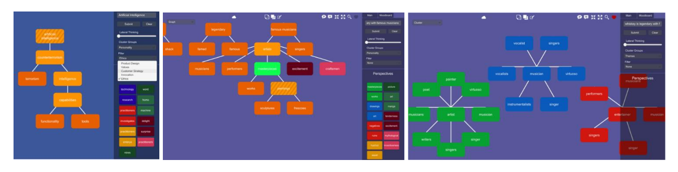
Figure 6: NeuroCreate's Innovator

Furthermore, we are actively planning the next stage of this prototype, namely to create a cylindrical holographic display with different brainwave visualisations for different participants - such as geometric abstract patterns and shapes ( Figure 5 and Figure 7 ). The future of this prototype development, might also see more therapeutic, academic or digital commercial applications such as through integration with Neurocreate's other existing product, the FlowCreate<sup>TM</sup> Innovator.