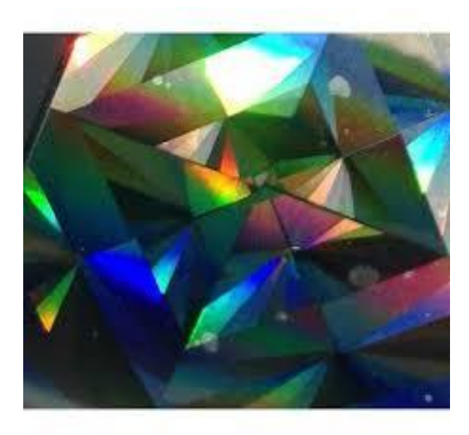
Figure 2: Light refractions

a controlled environment, designed within a creative cognition framework.