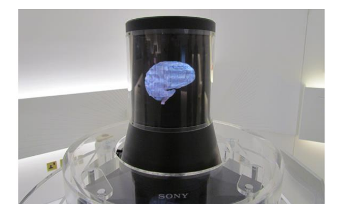
Figure 8: Cylindrical Hologram

The artwork has the potential to double up as an art work, while collecting data on audience interaction, helping to understand the full creative potential of participatory arts better. This focus on collaborative art forms, in the service of wellbeing, social connectedness and creative engagement forms part of a wider discourse on the societal impact of media arts.