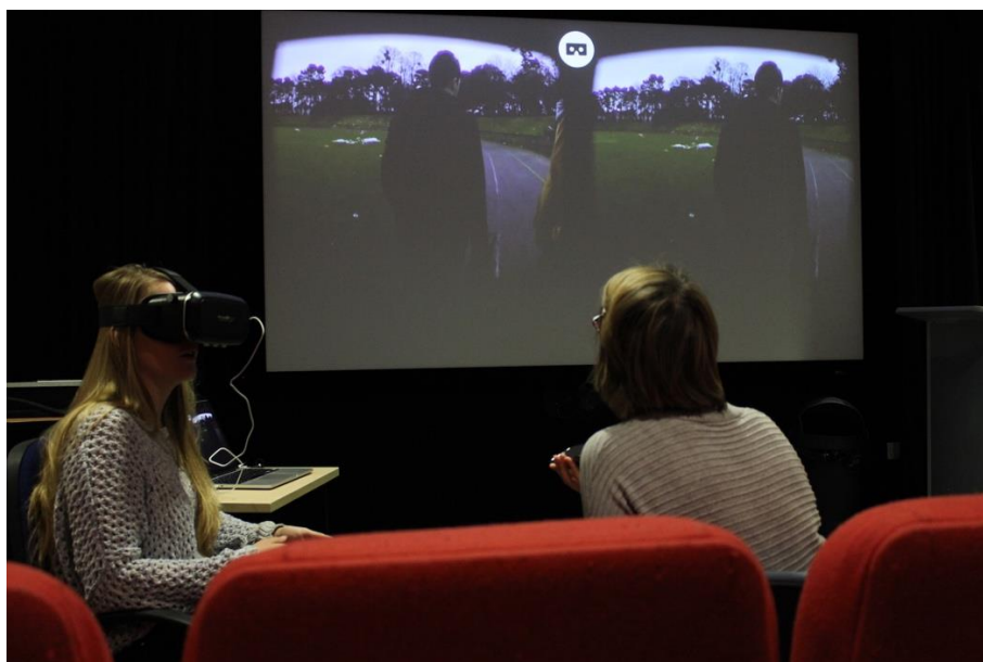
Figure 4: Image showing Student 1 with headset and mirrored view on laptop and cinema screen.