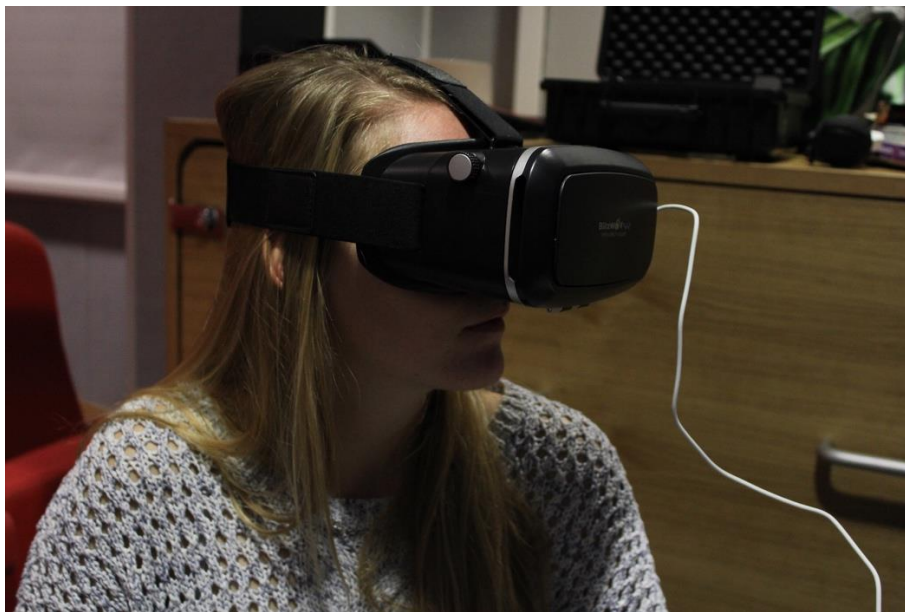
Figure 3: Student participant wearing VR visor

Two days after the 360-degree film clip capture, Student 1, the research participant, met with the researcher in a university screening room to be re-immersed into the field. This re-immersion was via the film clip on a smartphone slotted into a VR headset (see Figure 3). The student/participant watched two different sets of film clips through the VR headset each time watching the first clip (approximately 15 minutes in duration) without any prior discussion about content or steering. During this viewing, an informal conversation occurred (see Video Clip 1 ). We then stopped, removed the visor, and together read the paper risk assessment that was produced for their film shoot. Having read that, the student participant then re-watched the same 15-minute clip, whilst having a semi-structured conversation with the researcher/educator.