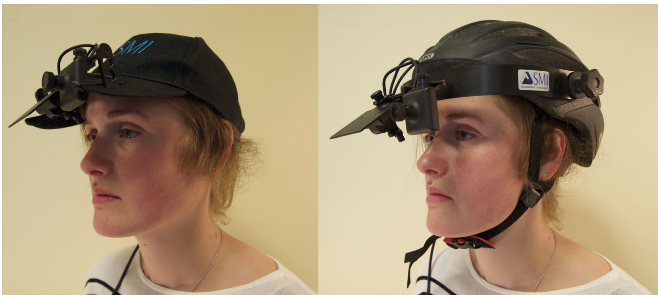
Fig. 1. Photos showing how the eye tracker was mounted in each of the two conditions: to a baseball cap (left) and a bicycle helmet (right).

Either an Abus (Phoenix, AZ) HS-10 S-Force peak bicycle helmet or a Beechfield (Bury, United Kingdom) B15 five-panel baseball cap was used to support the SensoMotoric (Teltow, Germany) head-mounted iView X HED-4.5 eye-tracking device (with its delicate 45° mirror removed; see Fig. 1). Participants responded to the scales using the Bristol Online Surveys Web site. All measures and the BART were completed on a 19-in. 4:3 LCD monitor. The experimenter "operated" an Applied Science Laboratories (Bedford, MA) Eye-Trac 6 desk-mounted optics system with Eye-Trac PC. A fake nine-point