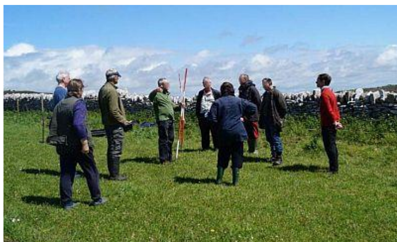
Participants learning how to conduct a resistivity survey during case study 2.

This article presents an approach to guide the planning, development and evaluation of community archaeology. This will assist practitioners of all forms of community archaeology by providing a pathway to ethical practice that will benefit all. The approach focuses attention on four elements that are integral to community archaeology and which should always be considered: Who (the people involved); Why (their motivation); the Archaeology (in the broadest sense, including research questions and research methods); and How (the specific format the community engagement will take). This framework is applied to three case study community archaeology projects in Dorset, England, in order to demonstrate challenging examples of planned and reflexive community archaeology.