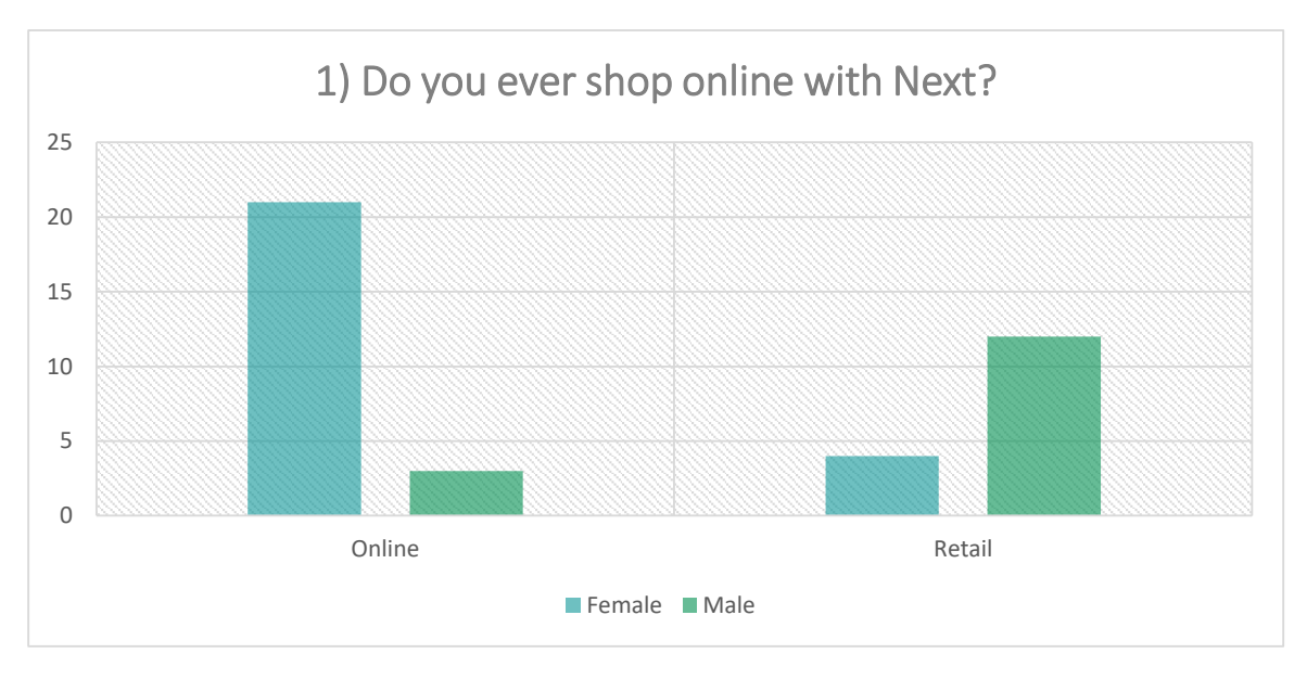
Figure 1. Demographics of respondents to Question 1 and their preferred shopping method.