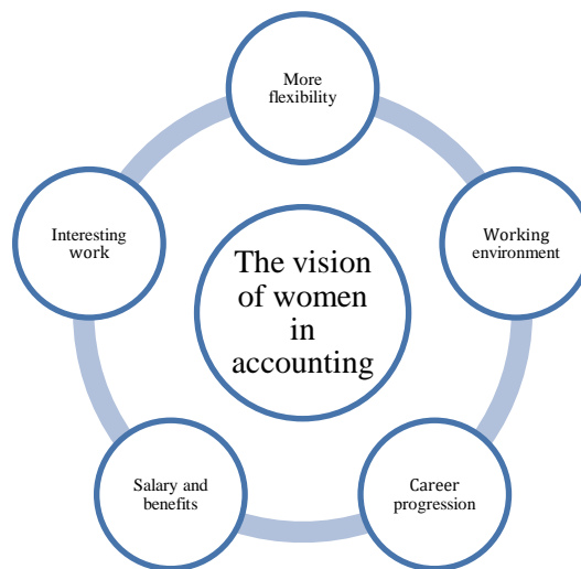
Fig 1. The most critical issues affecting the vision of women in accounting

The following figure provides the most critical issues that we suppose affect the vision of women in the accounting concerning the main research question.