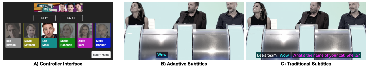
Figure 1: A) Adaptive Subtitles ‘Controller’ interface displaying speakers for BBC’s ‘Would I Lie To You?’ clip; Lee Mack has been toggled to have subtitles displayed. B) Adaptive Subtitles displaying subtitles for speakers selected in A. C) Traditional subtitles showing dialogue for all speakers.

BBC reported median but within 1 SD of reported limits [46]. All sessions were video and audio recorded from three angles: immediate left and right of participant to assist with understanding responses, and behind participants to view interaction with controller.