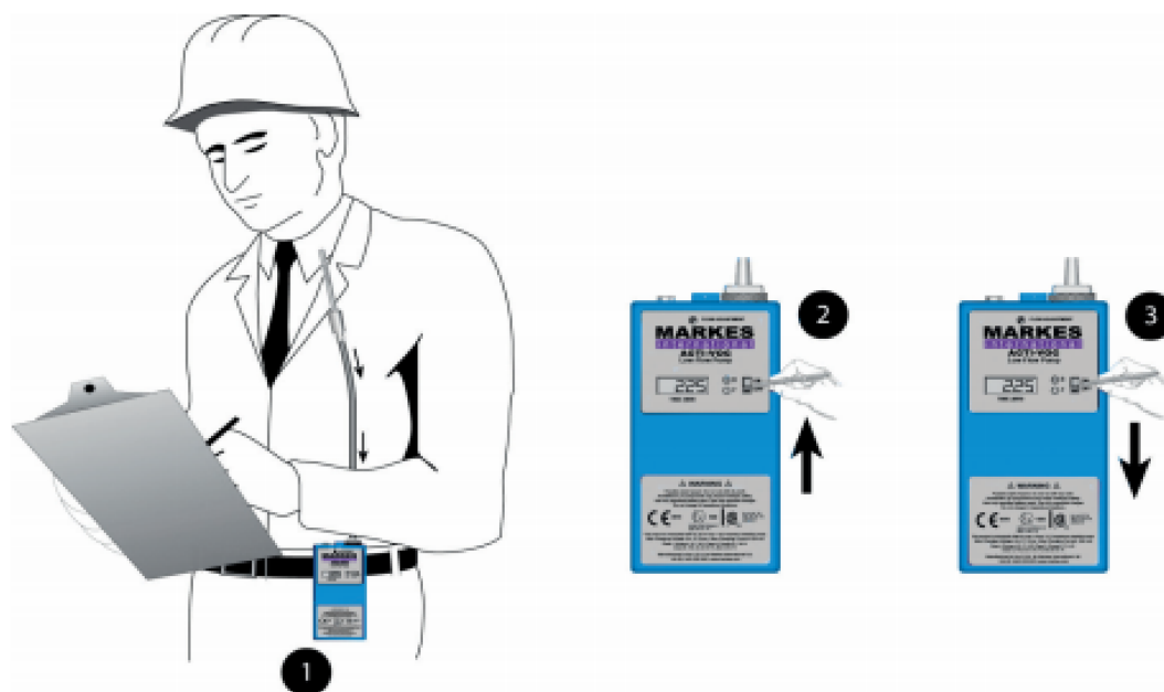
FIGURE 1 Diagram used to instruct volunteers on how to wear and attach the ACTI-VOC pumps [Colour figure can be viewed at wileyonlinelibrary.com ]

Two ACTI-VOC portable air pumps were provided to the 15 staff volunteers to be used during a 8- or 12-h shift during the study period. They are designed to use one TD tube at a time, at a set flow rate, whilst recording the sampling time. Figure 1 shows the setup of the ACTI-VOC units. The pump flow rate was set to 50 ml/min. The TD tubes were stored in an on-site, secure refrigerator and separated