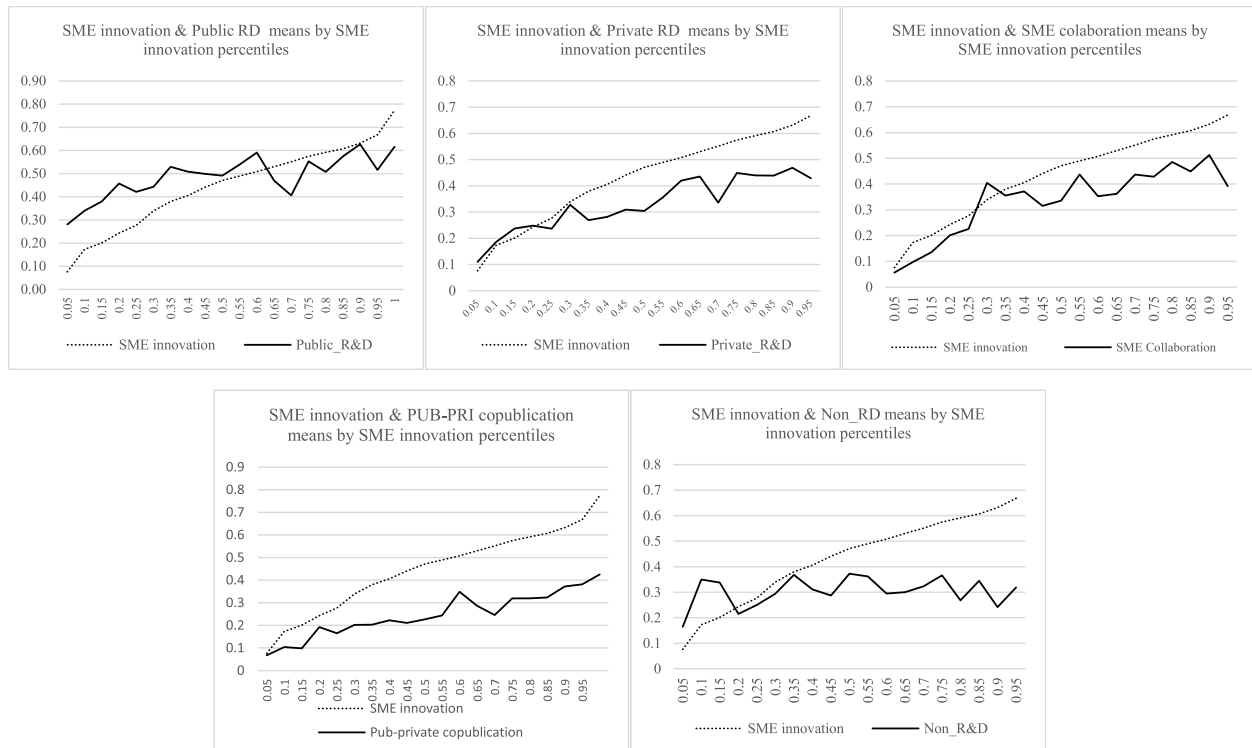
Fig. 1. Mean variation of variables across regional SME innovation quartiles.

according to the level of development of each region. To test whether this is the case, we use quantile regressions as a means to assess how the factors that affect SME innovation change according to variations in regional innovative capacity. The advantage of quantile regressions is that —by allowing estimating effects at different points in a distribution— they take into account the heterogeneous capacity of SMEs to innovate in regions at different levels of development.