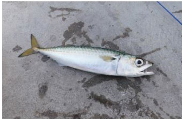
Scomber japonicus (Houttuyn, 1782) Medium pelagic Size: ~30 cm Trophic level: 3.4