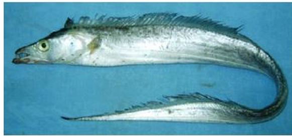
Trichiurus lepturus L. Large pelagic Size: ~1 m Trophic level: 4.4