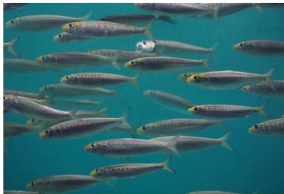
Sardinops sagax (Jenyns, 1842) Small pelagic Size: 10-20 cm Trophic level: 2.8