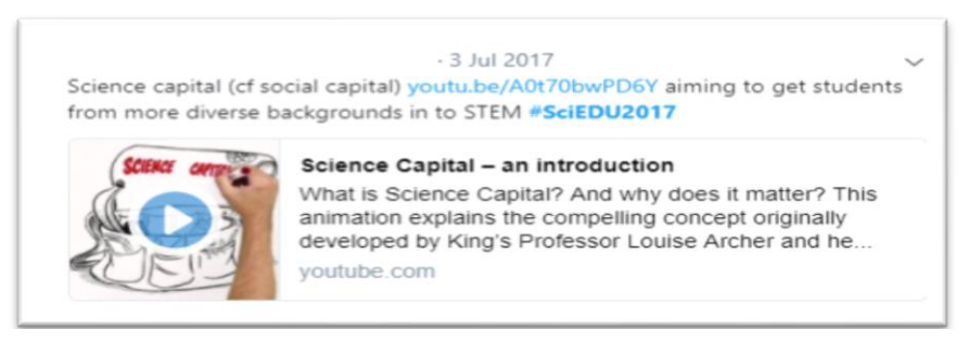
Figure 1: Post by delegate at the Mission to Mars Summer School

The aim of this summary was to persuade the delegates that their participation in the research was valued and valuable (see <u>Annexe 1</u>)