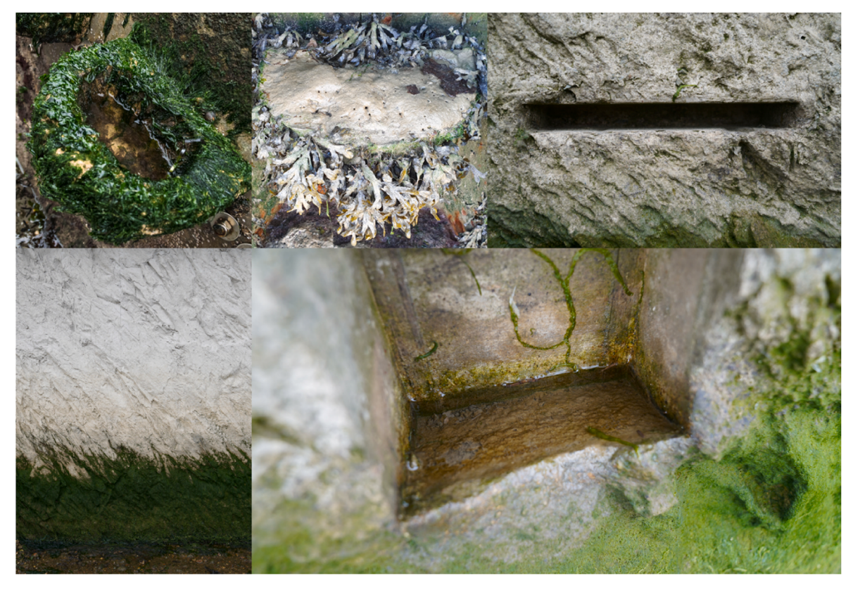
Fig. 2. Examples of coastal eco-engineering. Top left, clockwise: An artificial rockpool containing water (Marineff Project); a Vertipool containing mud (Bone et al., 2022); a 'letter box' crevice in a concrete seawall; a cubic void containing water in a concrete seawall; a concrete seawall with a 'rockface' textured surface created with a formliner.

There is some evidence that concrete is already more bioreceptive when compared to other materials and leaches chemo-attractive cues that encourages the settlement of some species (Anderson and Underwood 1994). For example, Anderson (1996) conducted lab and field tests that determined that calcium hydroxide leachate from cement enhanced recruitment of Sydney rock oysters (Saccostrea glomerata (commercialis) Gould, 1850). Several explanations as to the mechanism of this chemical cue were offered, including its indication of a potential site of high planktonic productivity and thus food resource, or its molecular role in triggering metamorphosis in larvae. Davis et al. (2017) found that, compared to High Density Polyethylene (HDPE) and granite, concrete was more bioreceptive to algal turf in mesocosm experiments, which may have been due to the dissolution of calcium from the