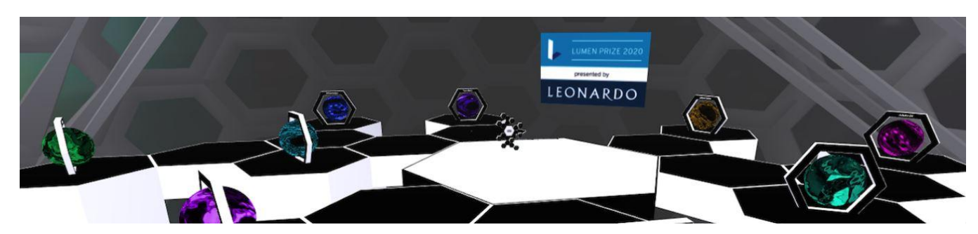
Figure 1: Leonardo Lumen Prize 2020 Exhibition Catalogue Lobby

"In the era of the electronic and digital interface, visuality is not simply an issue of the capture, manipulation, and representation of the visible anymore, nor even one of image literacy and cultural status, but, increasingly, one of display and interface. The question of which images have the power to move us is becoming entangled with that of how we move images, or, rather, how technology allows us to do so" (Beugnet, 2020:2)