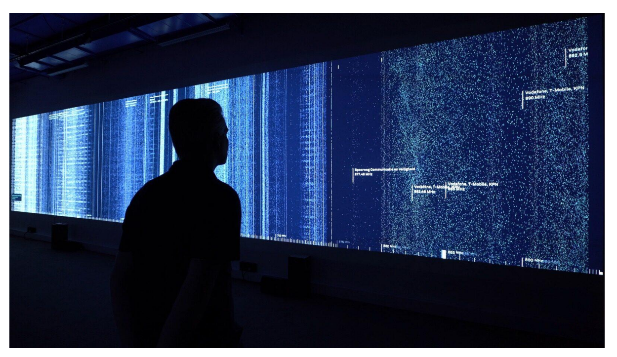
Figure 5: Richard Vijgen: Hertzian Landscapes - Lumen Prize 2020 3D / Interactive Award

this radio-signal landscape by positioning themselves in front of the panoramic canvas, in the physical space as much as in the virtual Lumen exhibition. At the same time, the audience observes the artwork in front of a screen within a screen, submerged into a field of possible inter-mediated interactions within the hexagonal-cellular structure of the Lumen exhibition catalogue.