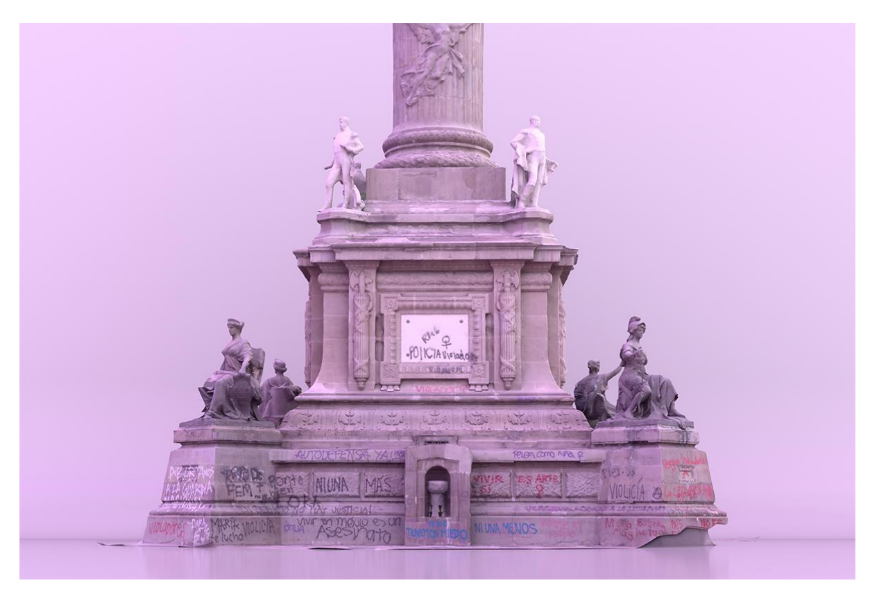
Figure 6: Julieta Gil: Nuestra Victoria - Lumen Prize 2020 Gold Award

collective memory (Halbwachs, 1980) in response to institutional erasure. As Gils states on her website, "The intention was not to make a perfect replica, but to also allow the materiality of this digital version to show through and reveal new layers of information about its process of preservation and restoration and allow the mistakes and imperfections of the scan to serve as a metaphor for the fragility of patriarchal institutions" (Gil, 2020).