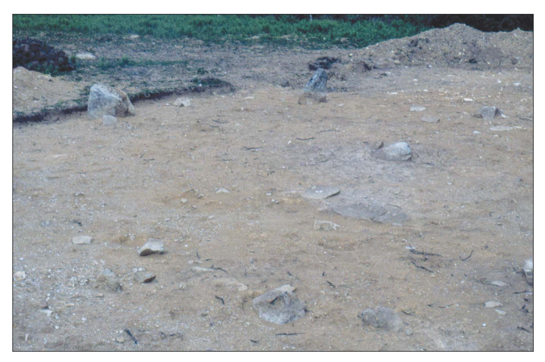
Figure 2. Parc Maen, Llangolman, Pembrokeshire. View northwards across the 1981–1982 excavation trench, with standing stones 2 and 3 in the background, several grounders projecting from the natural till, and a truncated extraction pit/hollow slightly right of centre (photograph by T. Darvill. Copyright reserved).

These lay at the focus of a wider ceremonial landscape that included a stone pair at Tafarn y Bwlch, 180m to the south-west (Figure 4), a standing stone, 200m to the west (Figure 5), and ring-cairns and hut-circles a similar distance to the north. During the late second and first millennium BC, elements of these focal structures fell or were robbed, leaving the remains much as we see them today.