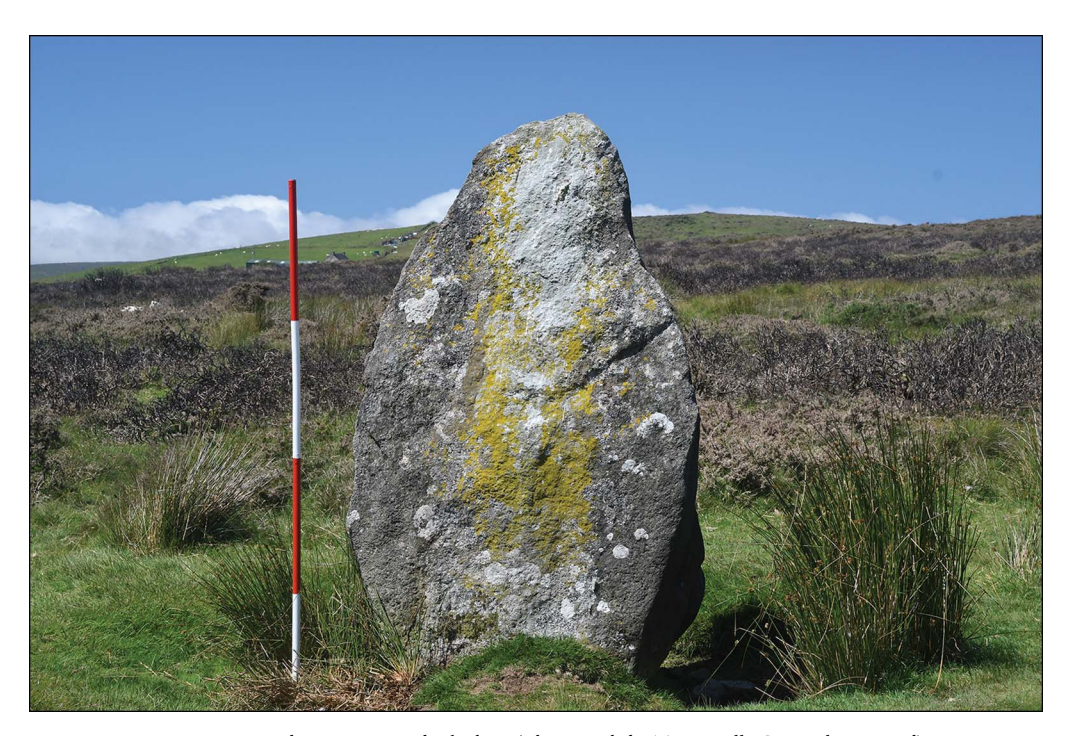
Figure 5. Waun Mawn standing stone, Pembrokeshire (photograph by T. Darvill. Copyright reserved).

© The Author(s), 2022. Published by Cambridge University Press on behalf of Antiquity Publications Ltd