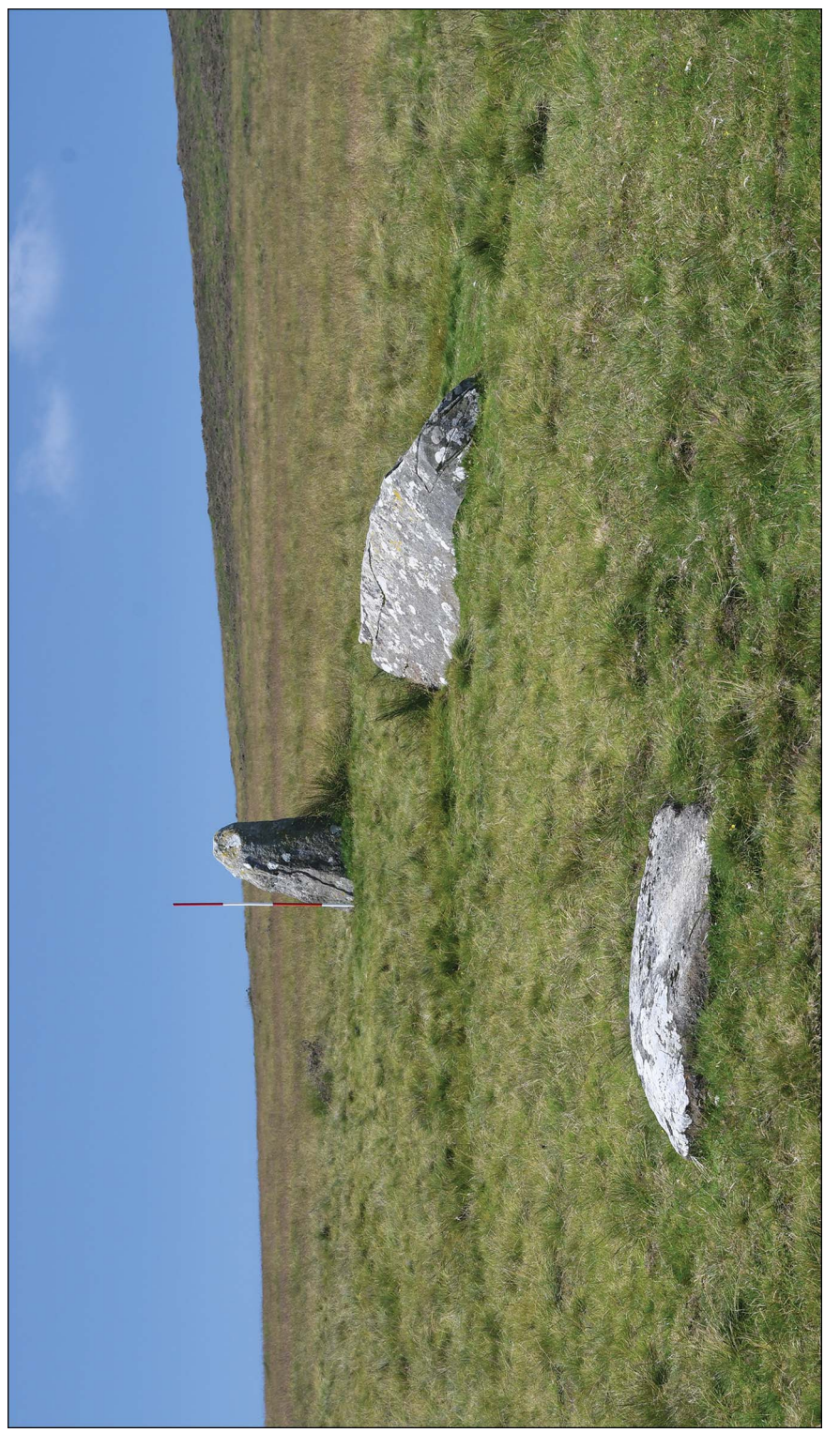
Figure 3. Waun Maun three-stone row, Pembrokeshire (photograph by T. Darvill. Copyright reserved).