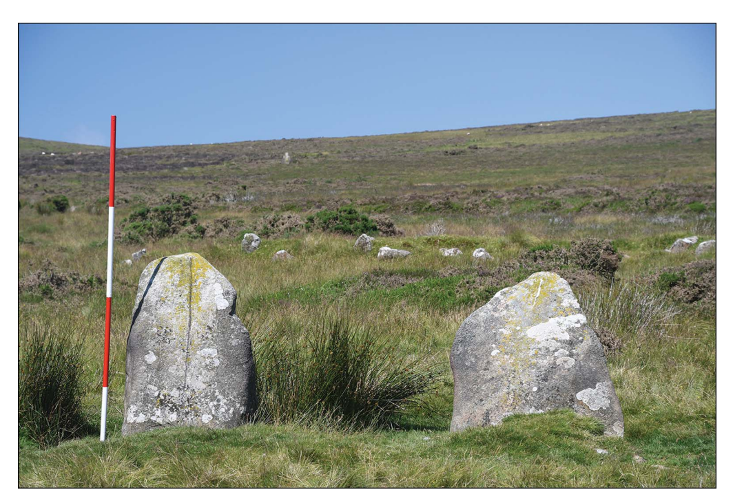
Figure 4. Tafarn y Bwlch stone pair, Pembrokeshire (photograph by T. Darvill. Copyright reserved).