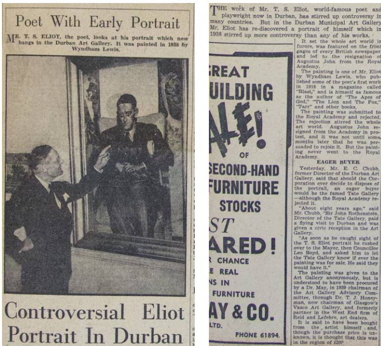
Fig. 3: 'Controversial Eliot Portrait in Durban', The Natal Mercury (27 January 1954).

focal point of the article (enhanced by the 'eyebrow'-type headline 'Poet With Early Portrait' and caption), also appears (courtesy of The Natal Mercury ) as a stand-alone photo in The Letters of Wyndham Lewis (see opposite L 253), betwixt Lewis's missives concerning the Academy's rejection of the portrait to the editors of the Daily Telegraph (dated 24 April 1938) and The Times (1 May 1938) respectively. 8 The actual newspaper story which accompanied the photo – albeit with its oddly less newsworthy main headline (or heading) 'Controversial Eliot Portrait in Durban' – goes further than the December 1939 article in disclosing that the portrait 'was given to the Art Gallery anonymously, but is understood to have been procured by a Dr. May, in 1939 chairman of the Art Gallery Advisory Committee, through Dr. T. J. Honeyman, now chairman of Glasgow's Vasco Art Gallery, and formerly partner in the West End firm of Reid and Lefebre [ sic ] art dealers. It is said to have been bought from the artist himself and, though the purchase price is unknown, it is thought that this was in the region of £200.'