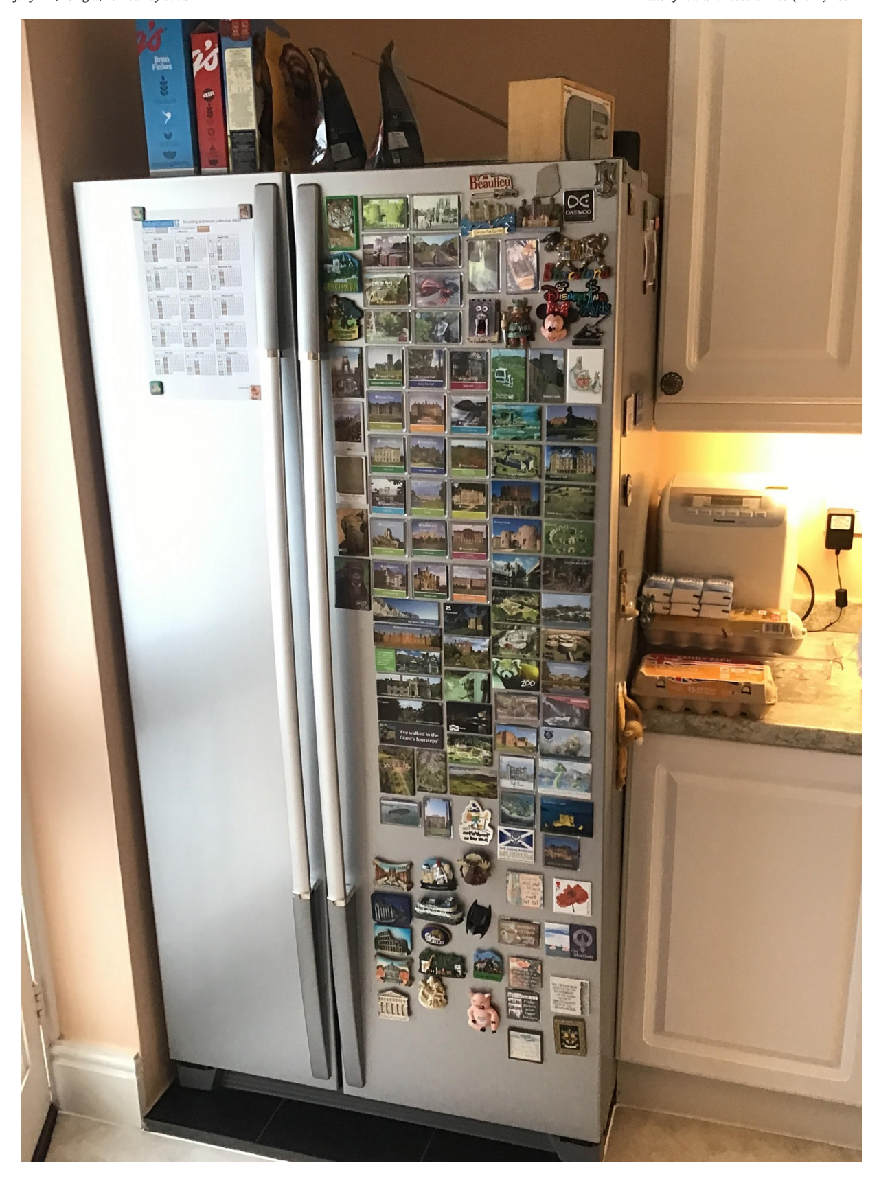
Fig. 2. Anthony and Patricia's fridge magnet collection.