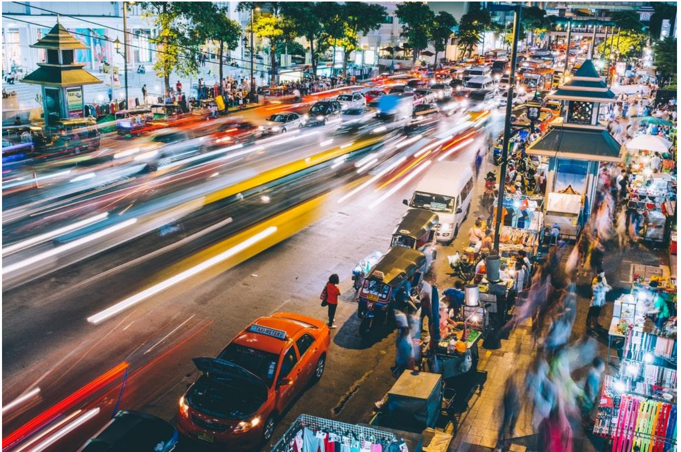
Figure 3 Tourists spend money at local markets and vendors contributing to economic growth in Bangkok, Thailand