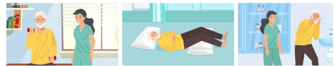
Contracture Awareness Video