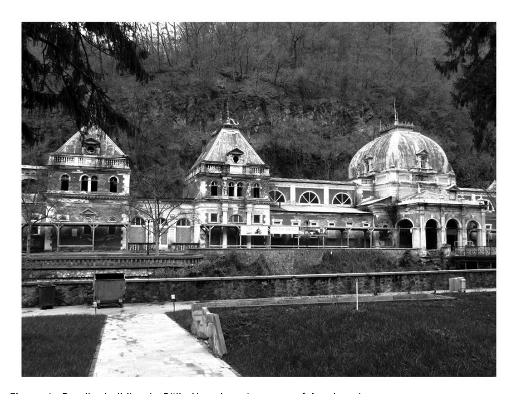
Figure 1. Derelict building in Băile Herculane.

A central concept within EEG is the metaphor of development 'paths' for explaining economic change (Sanz-Ibáñez et al., 2016). Path development is conceptualised as